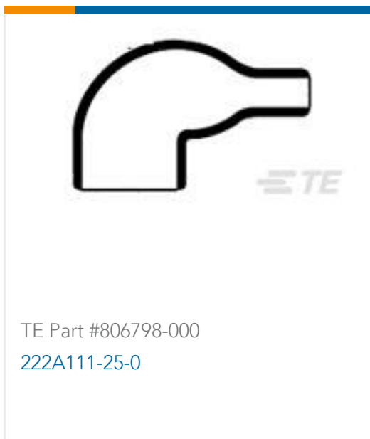
TE Part #806798-000 222A111-25-0