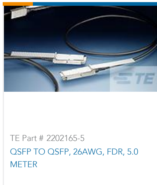
TE Part # 2202165-5 QSFP TO QSFP, 26AWG, FDR, 5.0 METER