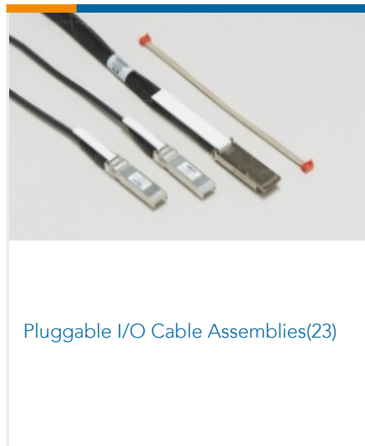
Pluggable I/O Cable Assemblies(23)