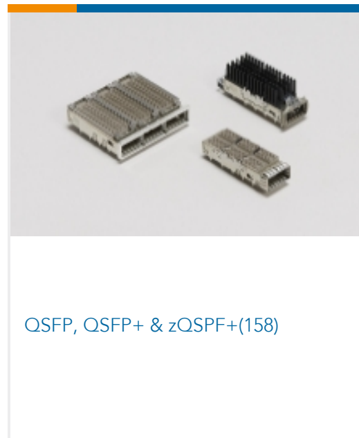
QSFP, QSFP+ & zQSFP+(158)