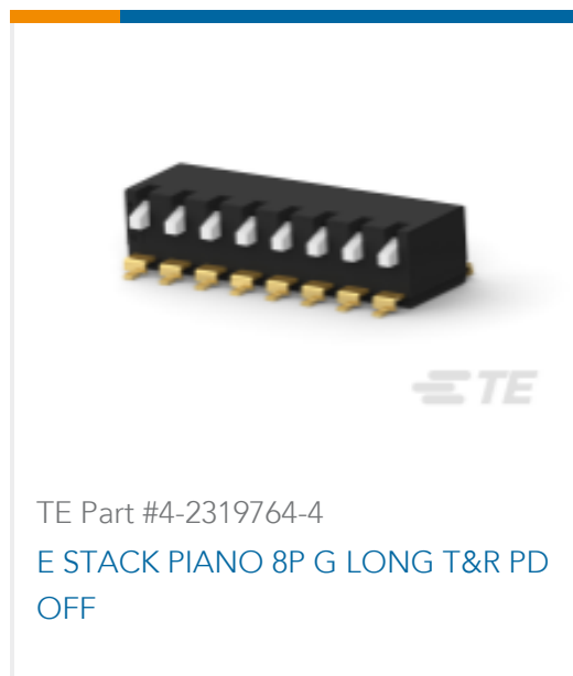
TE Part #4-2319764-4 E STACK PIANO 8P G LONG T&R PD OFF