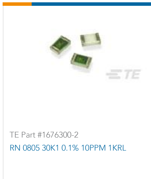
TE Part #1676300-2 RN 0805 30K1 0.1% 10PPM 1KRL