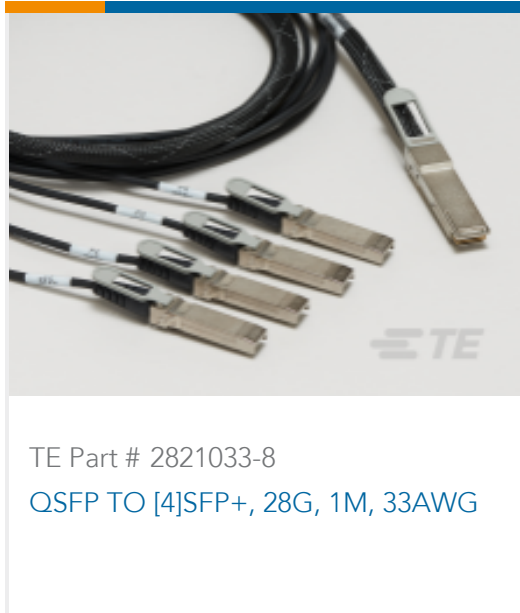
TE Part # 2821033-8 QSFP TO [4]SFP+, 28G, 1M, 33AWG