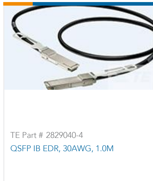
TE Part # 2829040-4 QSFP IB EDR, 30AWG, 1.0M