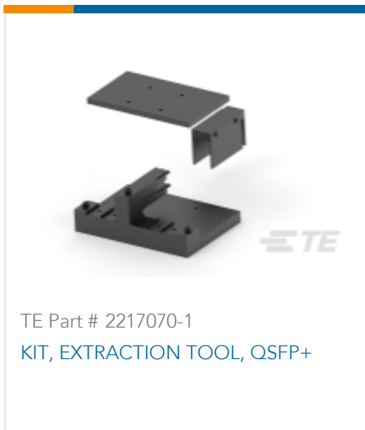
TE Part # 2217070-1 KIT, EXTRACTION TOOL, QSFP+