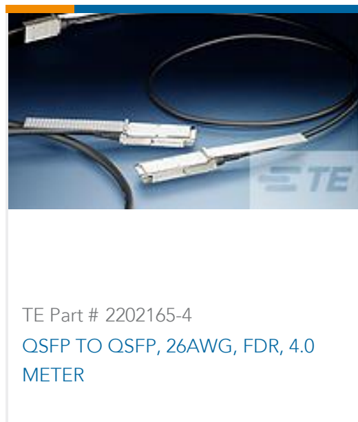
TE Part # 2202165-4 QSFP TO QSFP, 26AWG, FDR, 4.0 METER