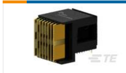
TE Part #1410189-3 MULTIGIG RT T2 7RW H-LFT,ET2