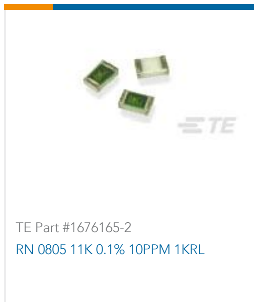
TE Part #1676165-2 RN 0805 11K 0.1% 10PPM 1KRL