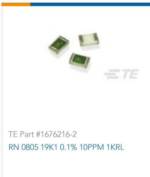
TE Part #1676216-2 RN 0805 19K1 0.1% 10PPM 1KRL