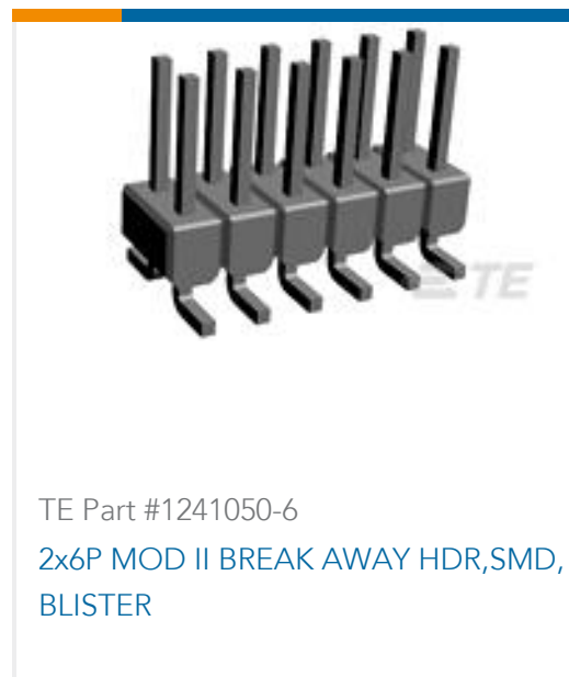
TE Part #1241050-6 2x6P MOD II BREAK AWAY HDR,SMD, BLISTER