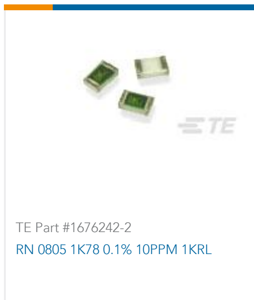
TE Part #1676242-2 RN 0805 1K78 0.1% 10PPM 1KRL