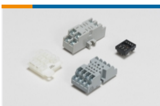
Relay Accessories, Sockets & Clips(54)