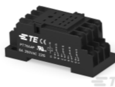
TE Part # 2071566-2 PT78A4P