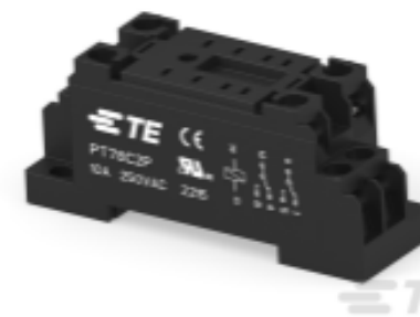
TE Part # 2071566-3 PT78C2P