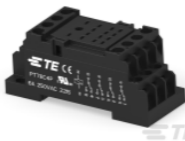
TE Part # 2071566-1 PT78C4P