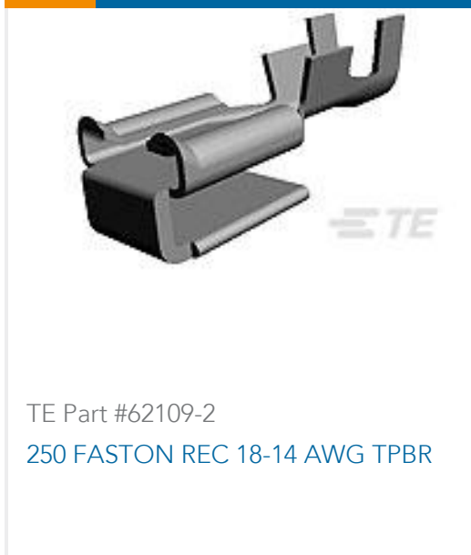
TE Part #62109-2 250 FASTON REC 18-14 AWG TPBR