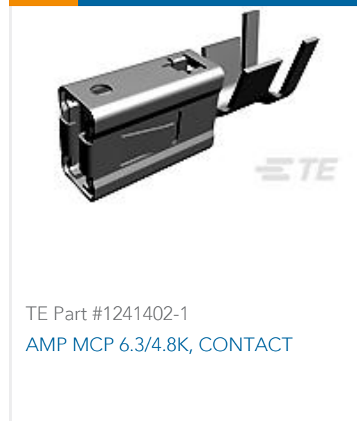
TE Part #1241402-1 AMP MCP 6.3/4.8K, CONTACT