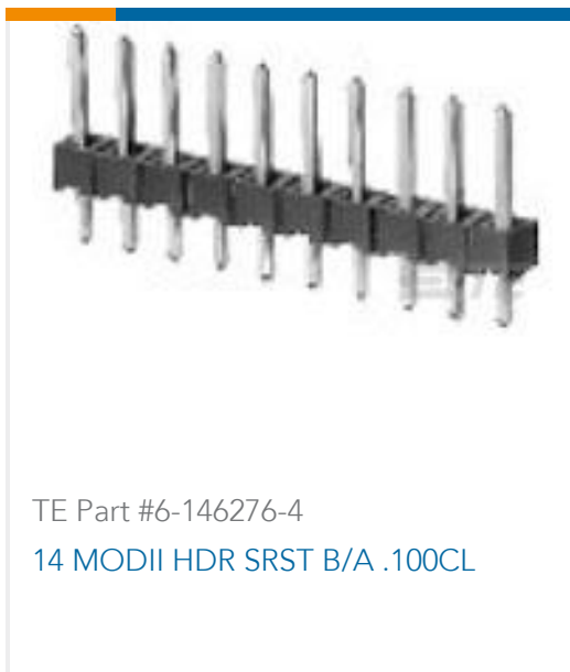
TE Part #6-146276-4 14 MODII HDR SRST B/A .100CL