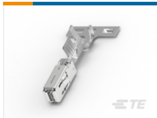
TE Part # 1-968876-1 AMP MCP 2.8, CONTACT SWS (LP)