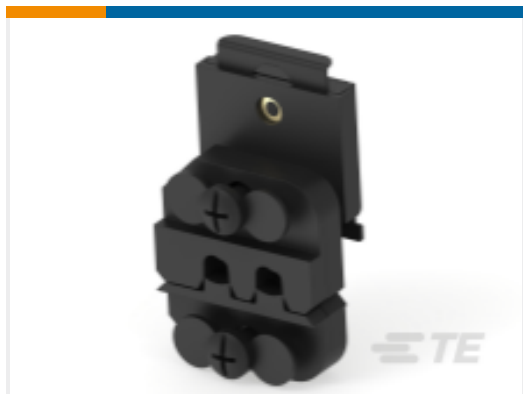
TE Part # 2063523-2 SDE SENSOR FLAT 1.5-4.0mm2 DIE SET