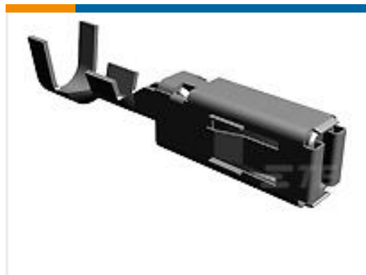
TE Part # 1-968876-3 AMP MCP 2.8, CONTACT SWS (LP)