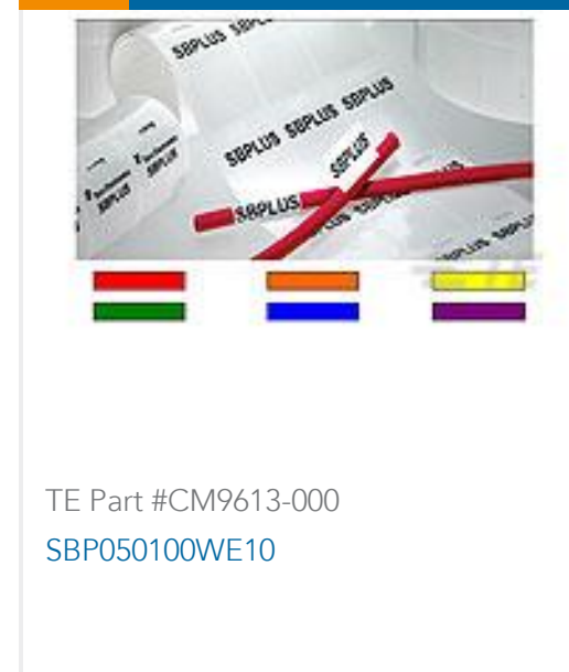
TE Part #CM9613-000 SBP050100WE10