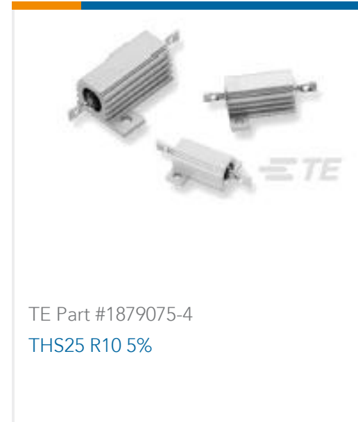
TE Part #1879075-4 THS25 R10 5%