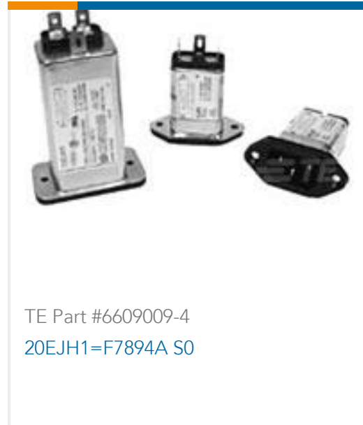
TE Part #6609009-4 20EJH1=F7894A S0