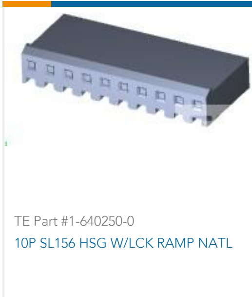
TE Part #1-640250-0 10P SL156 HSG W/LCK RAMP NATL