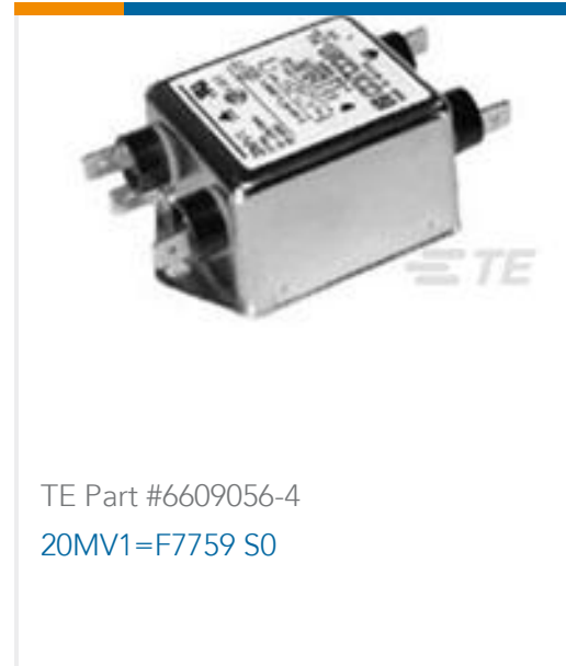
TE Part #6609056-4 20MV1=F7759 S0