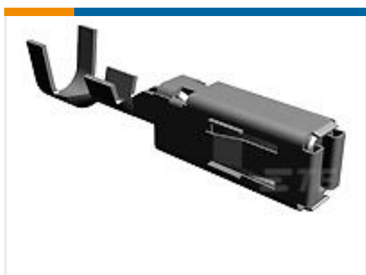
TE Part # 1-968877-3 AMP MCP 2.8, CONTACT SWS (LP)