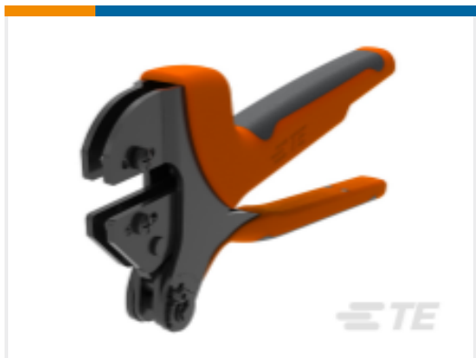
TE Part # 2362810-1 SDE CRIMP HAND TOOL FRAME W /O DIES