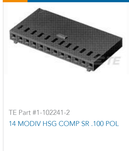
TE Part #1-102241-2 14 MODIV HSG COMP SR .100 POL