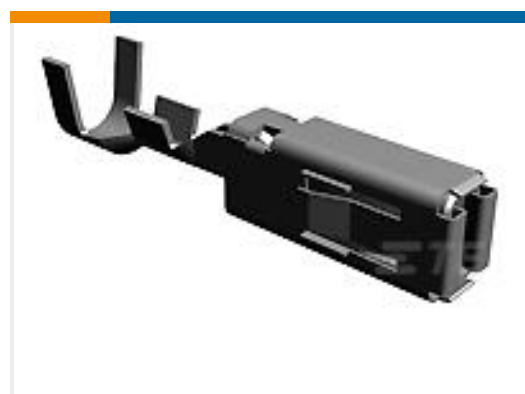
TE Part # 1-968877-1 AMP MCP 2.8, CONTACT SWS (LP)