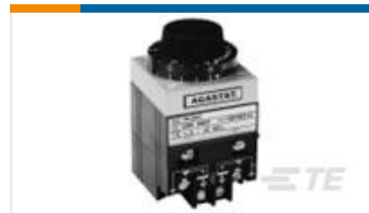
TE Part #1-1423159-6 7012OK=RLY,STD,ON,2P,24VDC,30