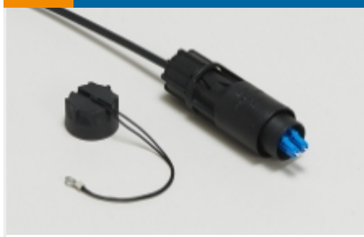
Rugged Fiber Cable Assemblies(20)