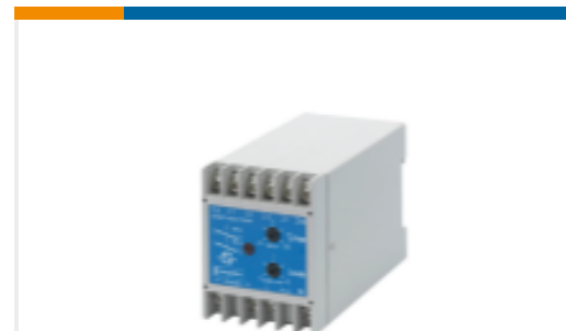
TE Part #C41674-000 CI-252-PVUU-PQBX-C6-EB