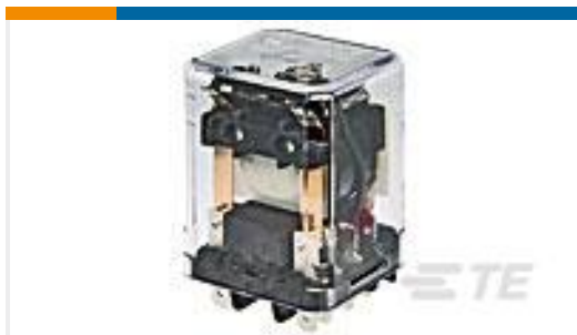
TE Part #1393114-1 KUUEP-3D15-24=KU-