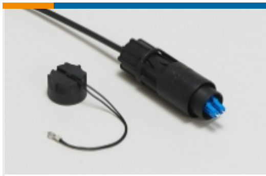
Rugged Fiber Cable Assemblies(20)