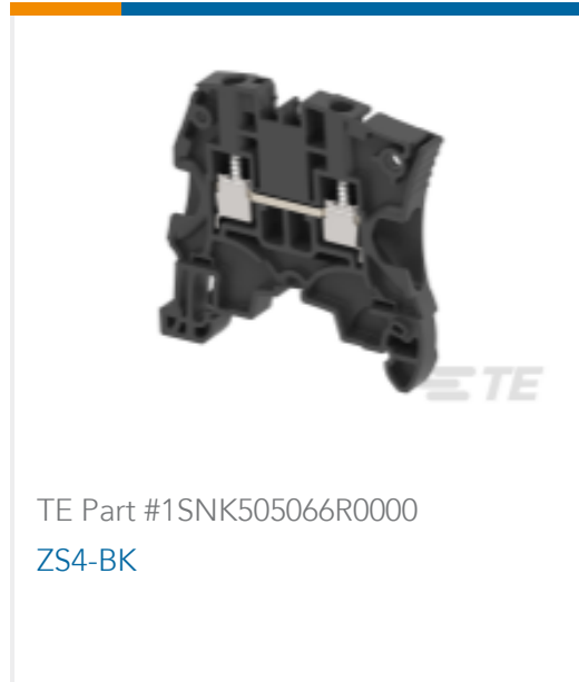
TE Part #1SNK505066R0000 ZS4-BK