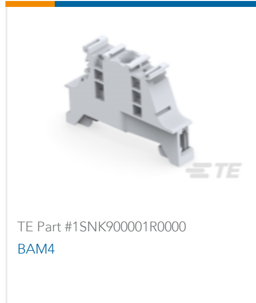
TE Part #1SNK900001R0000 BAM4