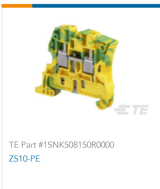
TE Part #1SNK508150R0000 ZS10-PE