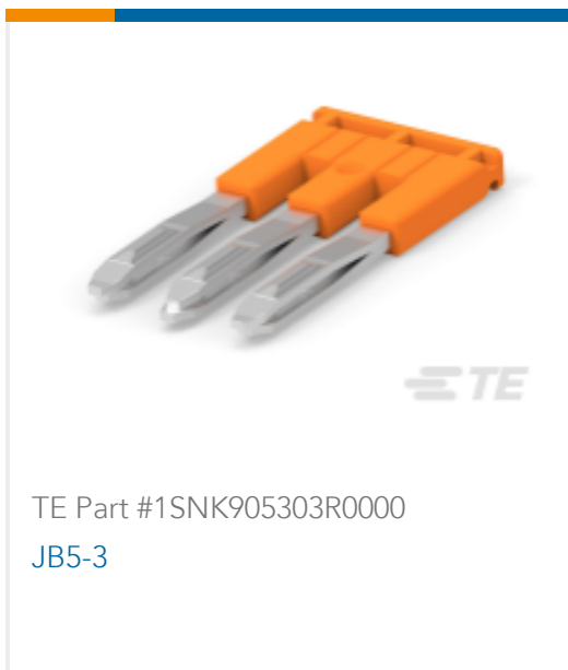
TE Part #1SNK905303R0000 JB5-3