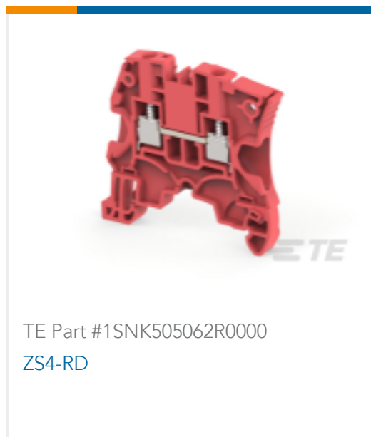
TE Part #1SNK505062R0000 ZS4-RD