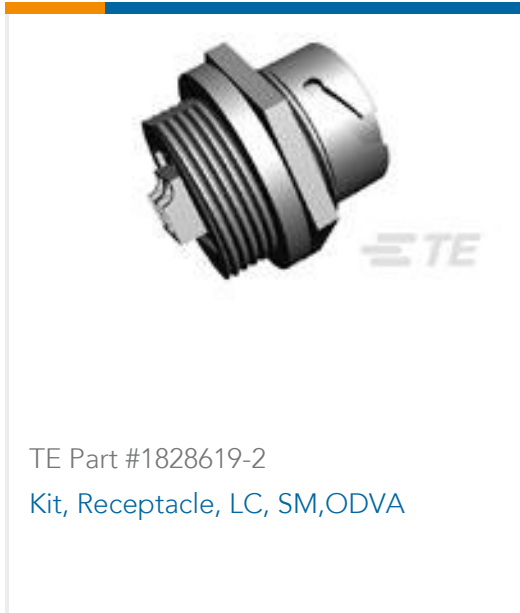
TE Part #1828619-2 Kit, Receptacle, LC, SM, ODVA