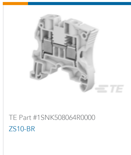
TE Part #1SNK508064R0000 ZS10-BR