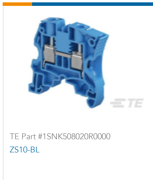
TE Part #1SNK508020R0000 ZS10-BL