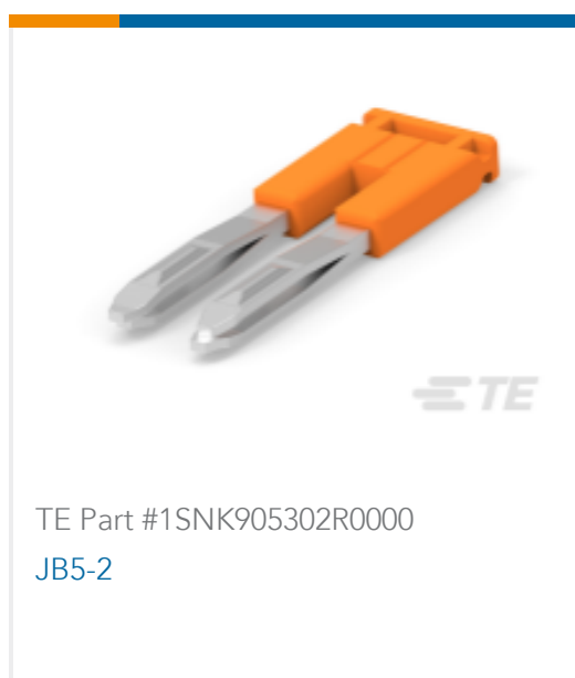
TE Part #1SNK905302R0000 JB5-2