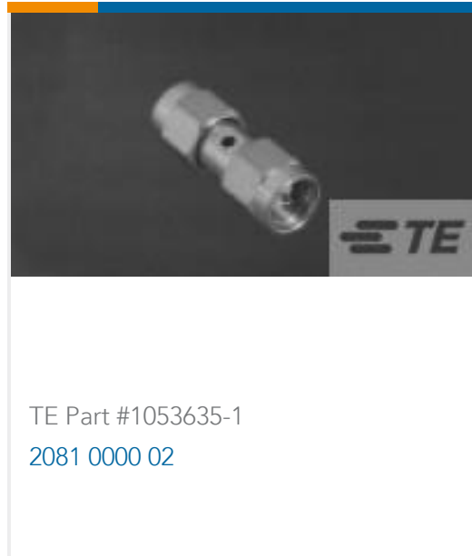
TE Part #1053635-1 2081 0000 02