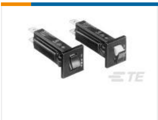
TE Part #3-1393250-3 W28-XQ1A-20=W28