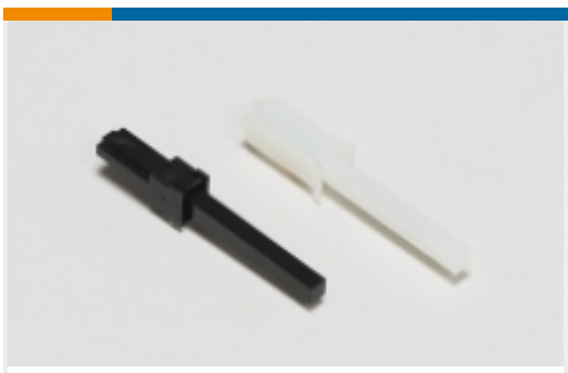
Circular Connector Keying Plugs(2)