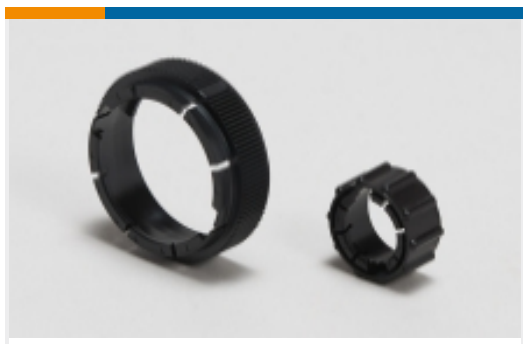
Circular Connector Adapters(7)