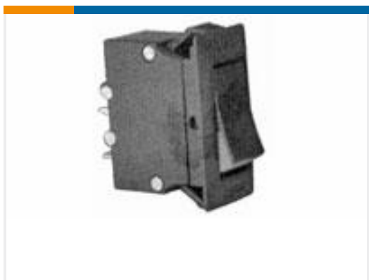
TE Part #1423673-6 W51-A121B1-15=CKTBKR,THERM,ROC