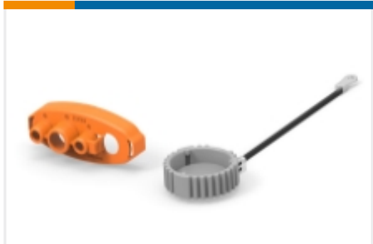
Connector Caps & Covers(16)