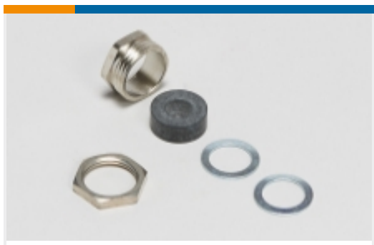
Circular Connector Hardware(3)