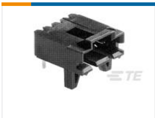
TE Part #103672-1 02 MTE HDR SRRA LATCH W/HLDWN