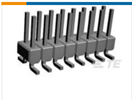
TE Part #1241050-8 2x8P MOD II BREAK AWAY HDR,SMD, BLISTER