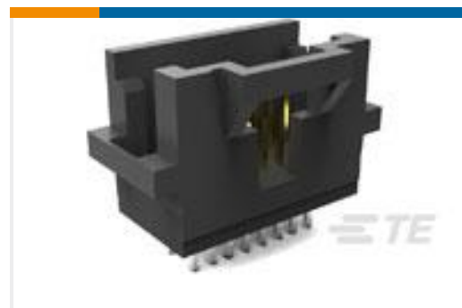
TE Part #6-104068-6 80 SYSTEM 50 HDR DRST SHRD