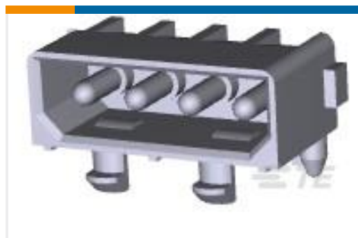
TE Part #1-641737-1 04P CMNL HDR ASSY R/A V0