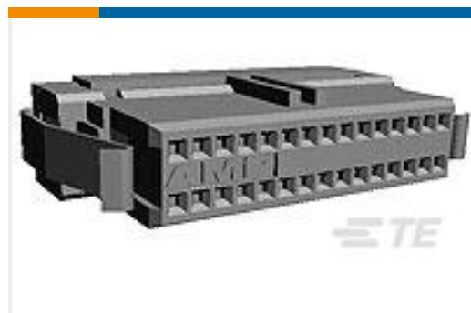
TE Part #3-111196-3 80 RCPT SYSTEM 50 30 DPLX