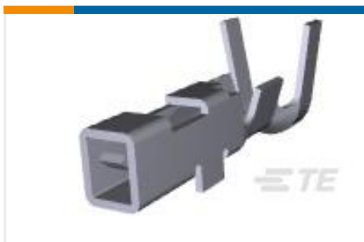
TE Part #1827588-2 DYNAMIC D1000 REC CONT L AU 0.38 um L/P