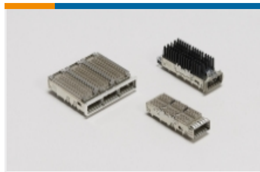
QSFP, QSFP+ & zQSFP+(158)