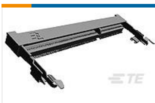
TE Part #2-2013289-1 EMBOSS TAPE DDR3 204P 5.2H STD