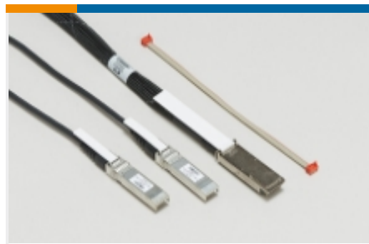
Pluggable I/O Cable Assemblies(23)