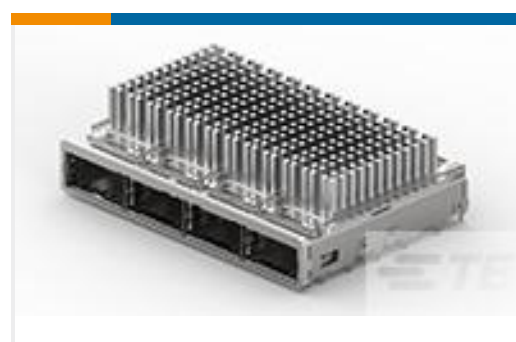
TE Part #2227249-3 1x4 Cage Assy Bhnd Bzl QSFP28