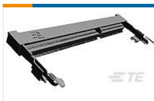
TE Part #2013290-1 SEMI-HARD TRAY DDR3 204P 5.2H RVS