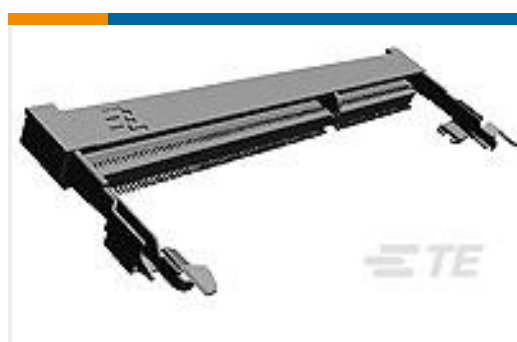
TE Part #2-2013290-1 EMBOSS TAPE DDR3 204P 5.2H RVS