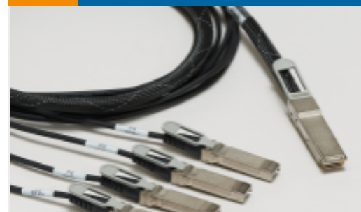
TE Part # 2821033-8 QSFP TO [4]SFP+, 28G, 1M, 33AWG