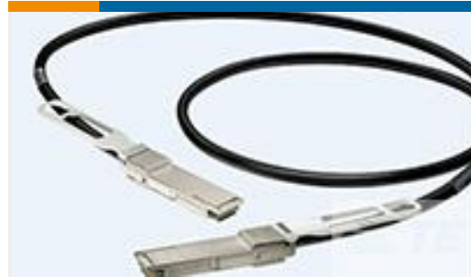
TE Part # 2829040-8 QSFP IB EDR, 26AWG, 3.0M