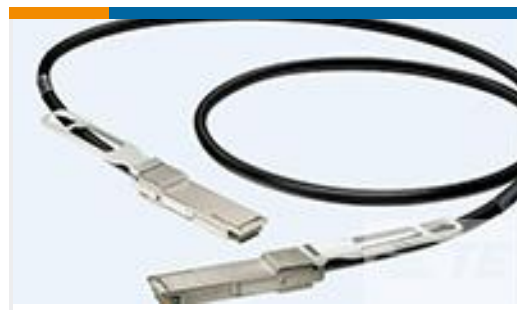
TE Part # 2829040-2 QSFP IB EDR, 33AWG, 1.0M