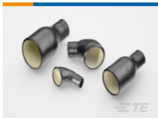
TE Part #EK7312-000 222S152-25C-0