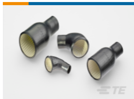
TE Part #EK7310-000 222S142-25C-0