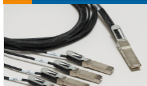
TE Part # 2821033-8 QSFP TO [4]SFP+, 28G, 1M, 33AWG