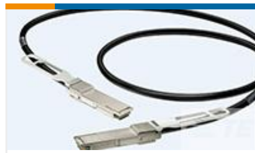
TE Part # 2829040-4 QSFP IB EDR, 30AWG, 1.0M