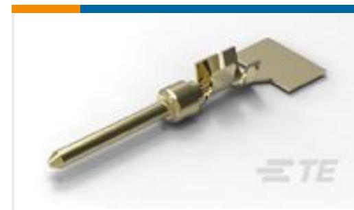
TE Part #66506-9 PIN CONTACT, 20 DF