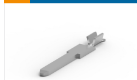
TE Part #184437-4 SENSOR TAB, 1.50 X .80, TIN PL