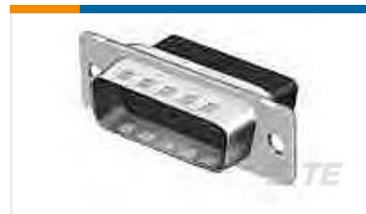
TE Part #205204-4 CRIMP SNAP PLUG ASSY,SIZE 1