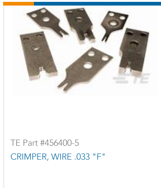
TE Part #456400-5 CRIMPER, WIRE .033 "F"