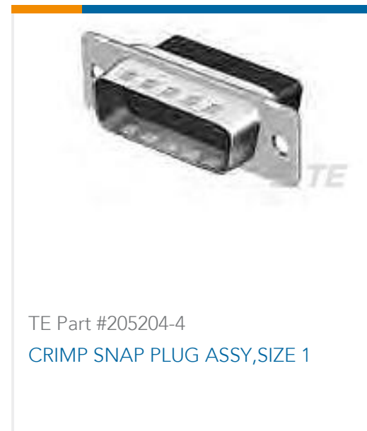
TE Part #205204-4 CRIMP SNAP PLUG ASSY,SIZE 1