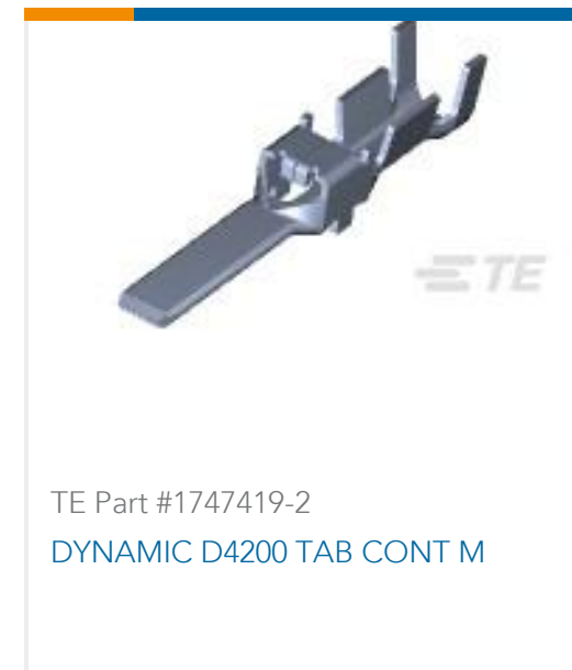
TE Part #1747419-2 DYNAMIC D4200 TAB CONT M