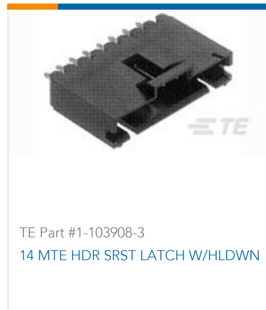
TE Part #1-103908-3 14 MTE HDR SRST LATCH W/HLDWN