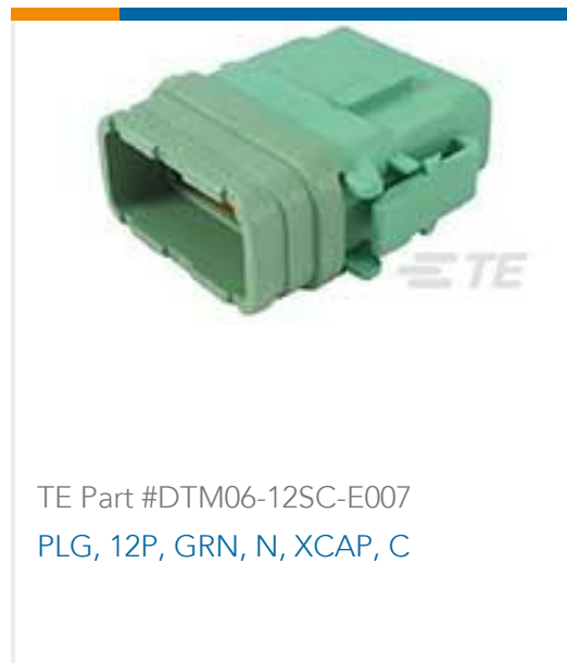
TE Part #DTM06-12SC-E007 PLG, 12P, GRN, N, XCAP, C