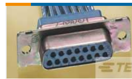
TE Part #207463-1 CRIMP SNAP RCPT ASSY, SZ 3