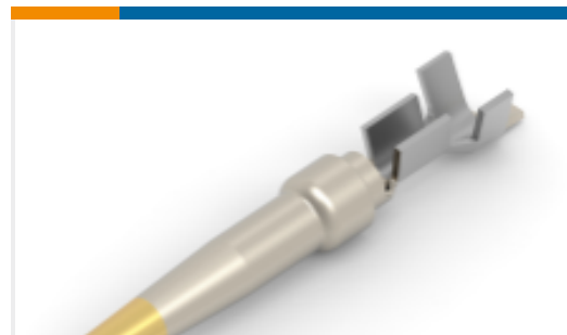
TE Part #745253-6 D-Sub Conn Contacts: Socket, Phosphor Bronze, Signal, Size 20