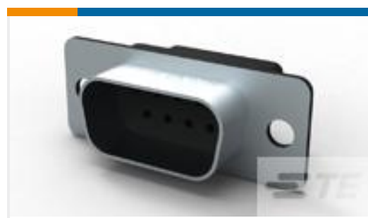
TE Part #205204-8 HDP-20, PLUG, SIZE 1, 9 POSN