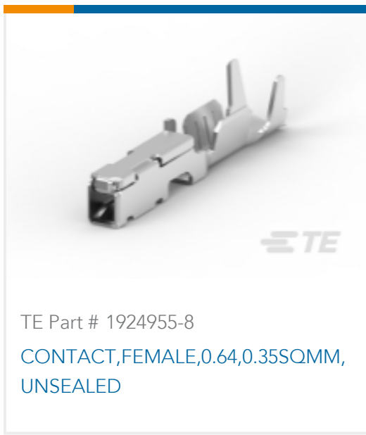
TE Part # 1924955-8 CONTACT,FEMALE,0.64,0.35SQMM, UNSEALED