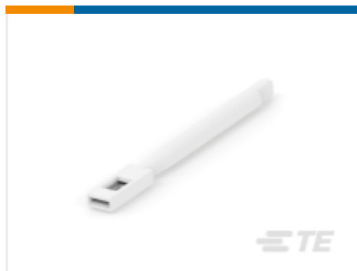
TE Part #2373242-1 CVTY PLUG,2.8 APEX FCI,CVTY DIA, MAT-SL