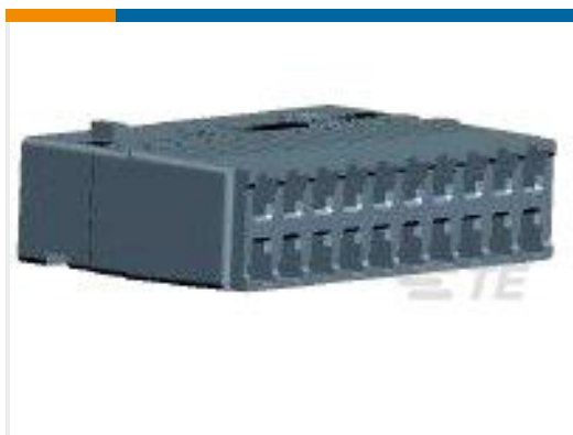
TE Part #2098634-1 Carrier, 20P, GY LAC, Black