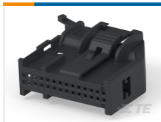
TE Part #2378797-1 Shield, 26P GenY, Hand Mate Conn