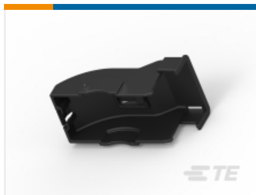
TE Part #2098622-1 36P UNSEALED HYBRID WIRE DRESS