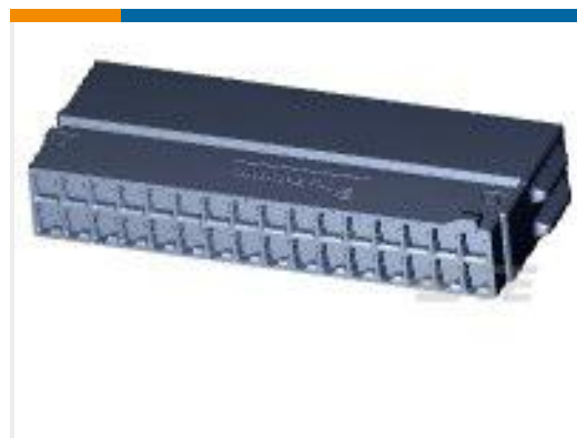
TE Part #2098216-1 32P Carrier, GY