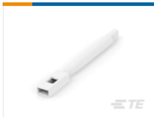
TE Part #2378043-1 CVTY PLUG,2.8 APEX FCI,CVTY DIA, MAT-SL