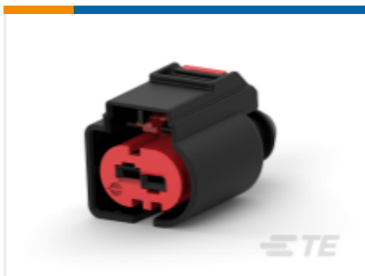
TE Part #2-2236706-1 2-POS. SEALED 2.8MM USCAR CLEAN BODY FOR