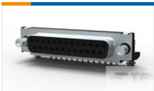
TE Part #5747846-6 25 MSFL RCPT RA 318 (SL,FM,BL)