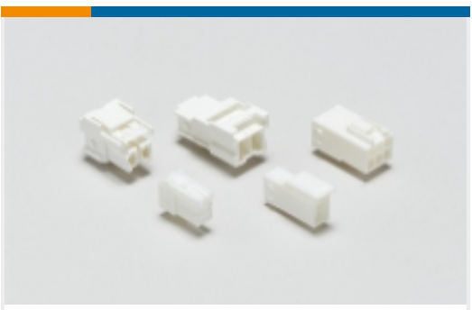
Rectangular Power Connectors(66)