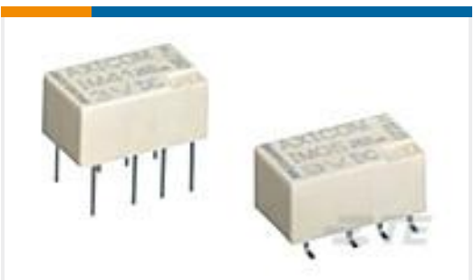
TE Part #3-1462039-2 IM26TS=IM RELAY 50mW 12V