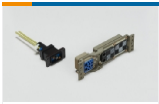
Rack & Panel Connectors(1)