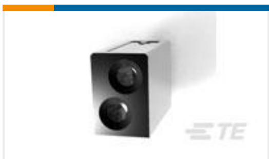
TE Part #1-1469373-1 ATCA GUIDE MODULE RA FEMALE