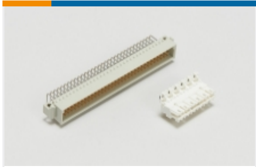
Standard Edge Connectors(2)