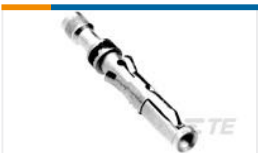
TE Part #201580-1 SKT CONT ASSY,TYPE II