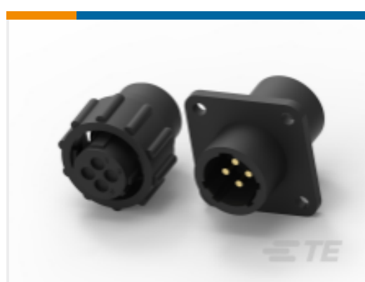
TE Part # CAT-AM71-C83998J Cable/Panel Mount Connector, CPC Series 1