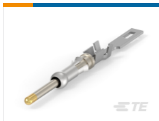
TE Part # 202236-7 III+PIN,SOLTAB,30AU>10,LP,SN