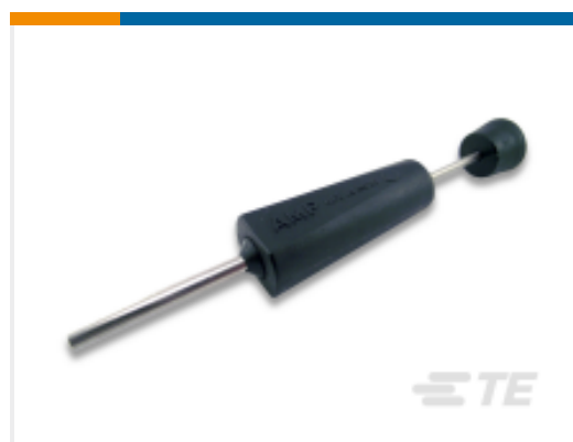
TE Part # 305183 EXTRACT TOOL TYPE 2 20-16