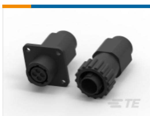
TE Part # CAT-AM71-C83998Y One-Piece Connector, Sealed, CPC Series 1