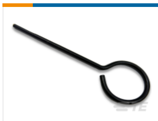
TE Part # 200893-2 INSERTION TOOL CONT