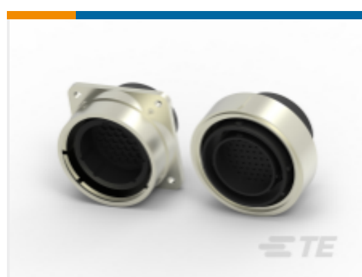
TE Part # CAT-AM71-C83998C Circular Plastic Connector, CMC Series 1