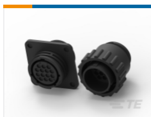
TE Part # CAT-AM71-C83998K Circular Connector, Environmentally Sealed, CPC Series 6