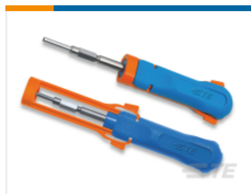
TE Part # 539972-1 EXTRACTION TOOL