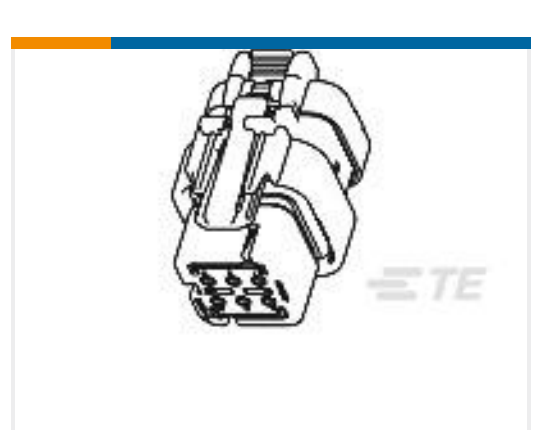
TE Part #776532-1 AS 16, 8P PLUG ASSY, RD, KEY 1