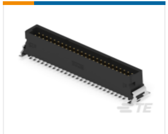
TE Part #244838-E SMCQ 50 M AB VV 8-13 CL * H007 137 E005