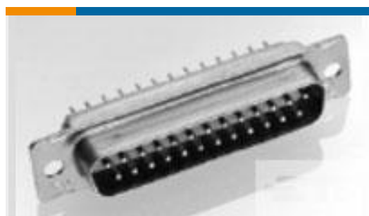
TE Part #1757829-3 AMPLIMITE,PLUG ASY,POSTD,109,ZN, 3