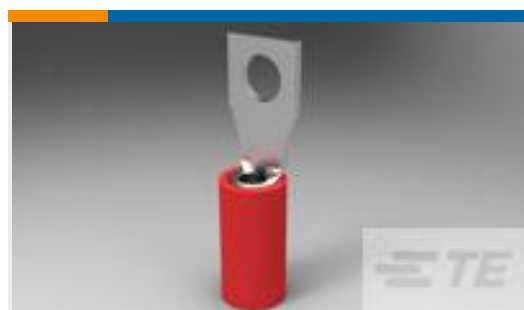
TE Part #2-327950-1 PIDG RECT 22-16COMM 22-18MIL 5