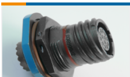
TE Part #YDTS24T21-11PAV001 RECP ASSY