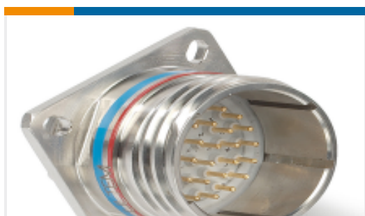
TE Part #YDTS20T17-06PNV001 RECP ASSY