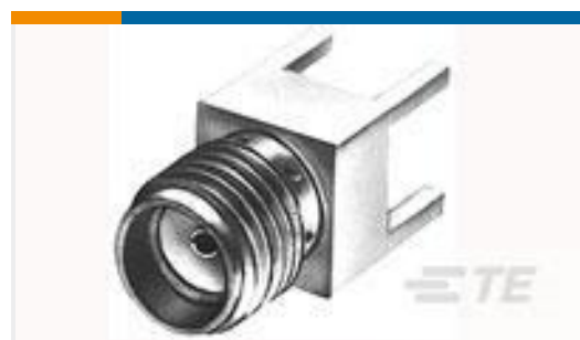
TE Part #1053372-1 2062 8001 90,OSM JACK, OPL