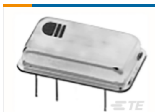
TE Part #3-1618400-8 DS11-1005T=SOLID STATE RELAY