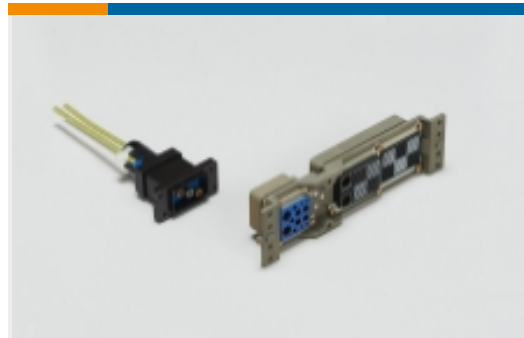
Rack & Panel Connectors(1)