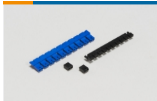
Board-to-Board Jumpers & Shunts(7)