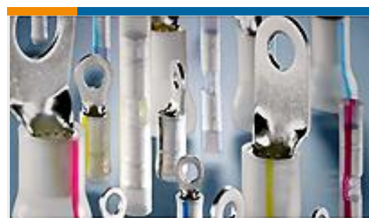
TE Part #53410-1 TERMINAL,PIDG PVF2 R 22-16 1/4