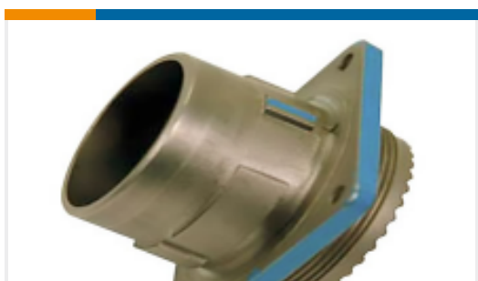
TE Part #YDIV40E21-11PNC009 RECP ASSY