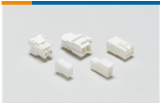
Rectangular Power Connectors(66)