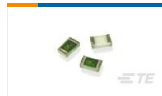
TE Part #5-2176094-1 RP 2A 0.25W 402K 0.1% 25PPM 1K RL