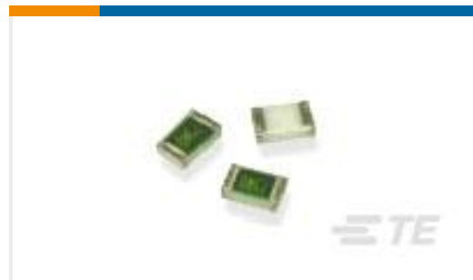
TE Part #2176088-7 RP 1J 0.166W 866R 0.1% 25PPM 1K RL