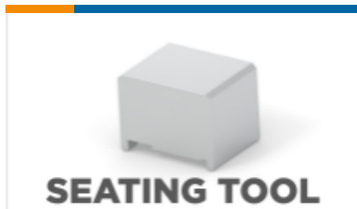
TE Part # 2018513-1 TL, SEAT 4 PR 16 COL BP CONN