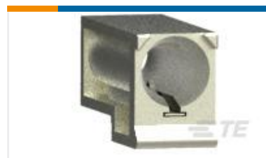
TE Part #1-1469492-1 MULTIGIG RT 9MM GUIDE/ESD 0 DEG