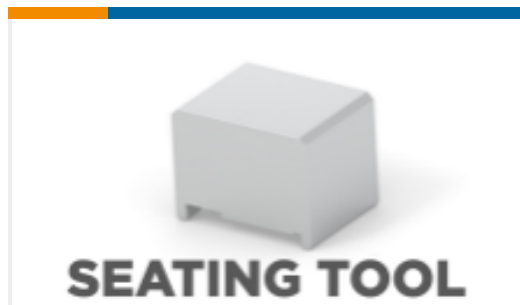
TE Part # 2018524-1 TOOL, SEAT 4 PR 10 COL,BP CONN