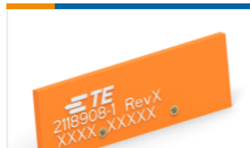
TE Part #2118908-1 PCB WLAN TRIPLE BAND BULK PACKAGED