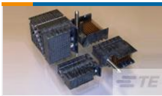
TE Part #2007809-1 IMP100S,H,V4P10C,LG,OEW39,4.5