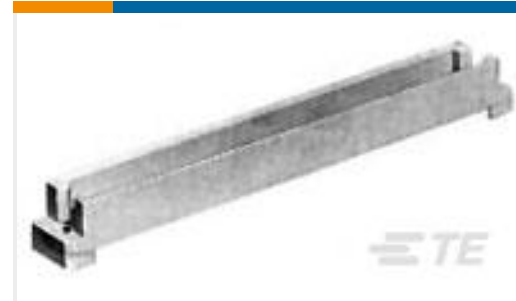
TE Part #535074-1 EURO SHROUD 96 POS