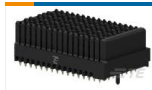
TE Part #1410142-1 MULTIGIG RT T2 .8" BP FULL RGH