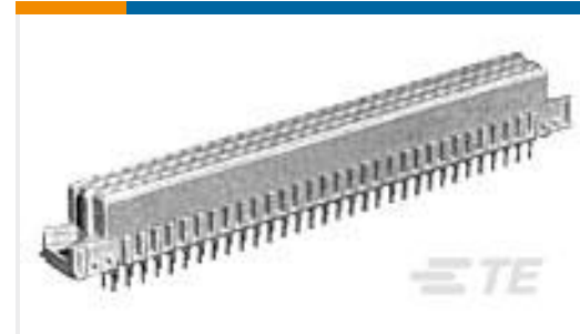
TE Part #5535032-4 ASSY,RECEPTACLE,EUROCARD,TYPE