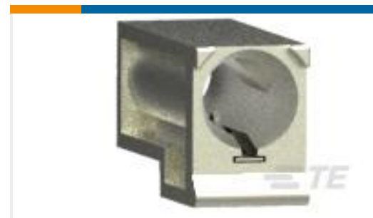
TE Part #1-1469492-8 MULTIGIG RT 9MM GUIDE/ESD 315 DEG