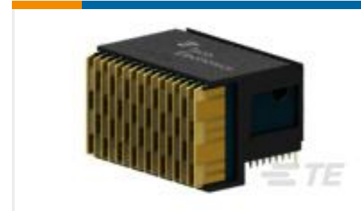
TE Part #2102771-1 DC, 7Row, Center, MULTIGIG RT 2R