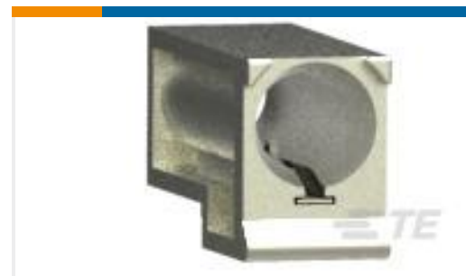
TE Part #1-1469492-9 MULTIGIG RT 9MM GUIDE/ESD UNKE