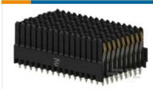
TE Part #1410140-1 MULTIGIG RT T2 .8" BP FULL CNT