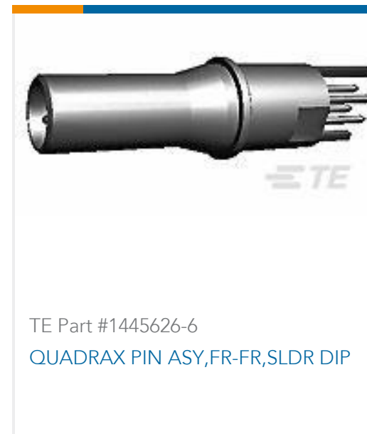
TE Part #1445626-6 QUADRAX PIN ASY,FR-FR,SLDR DIP