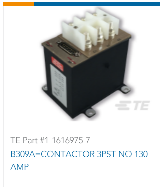
TE Part #1-1616975-7 B309A=CONTACTOR 3PST NO 130 AMP