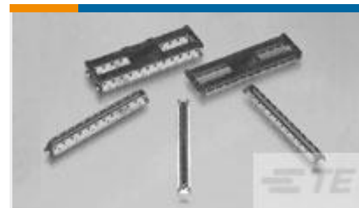
TE Part #3-1827233-6 .5FHP05H,440,B,GIG,08/Sn,HT,NS