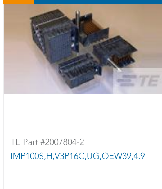
TE Part #2007804-2 IMP100S,H,V3P16C,UG,OEWS39,4.9