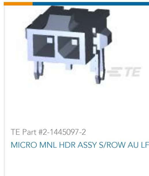
TE Part #2-1445097-2 MICRO MNL HDR ASSY S/ROW AU LF