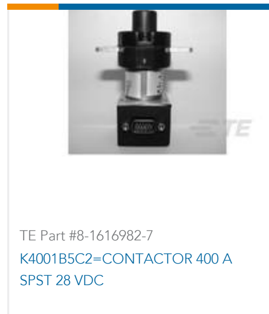
TE Part #8-1616982-7 K4001B5C2=CONTACTOR 400 A SPST 28 VDC