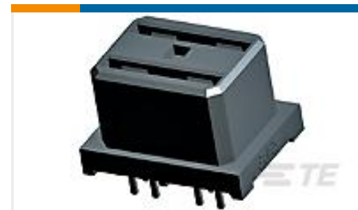
TE Part #2169806-1 IMP,Power,3PR,Vert,Recp,Tin