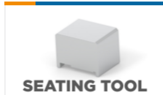
TE Part # 2018531-1 TOOL, SEAT 4 PR 16 COL,BP CONN