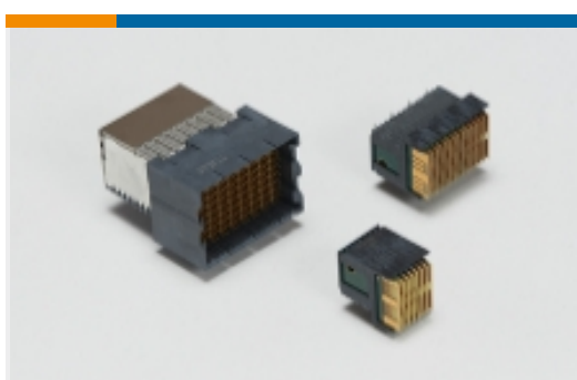
High Speed Backplane Connectors (1768)