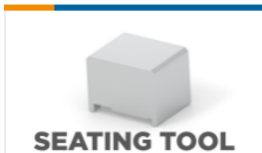
TE Part # 2018381-1 TOOL, SEAT 3 PR 16 COL, BP CONN