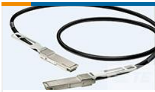
TE Part # 2829040-4 QSFP IB EDR, 30AWG, 1.0M