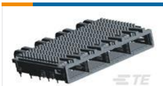
TE Part #2007626-1 1x4 QSFP Kit Assy Sqr LP, SAN Htsnk