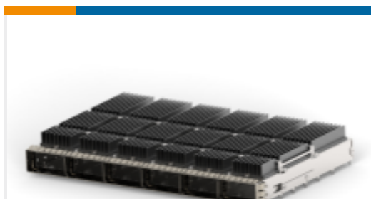
TE Part #2342891-2 CAGE ASSY 1X6 QSFP-DD HS EXTRUSION SAN