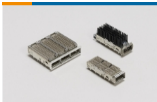
QSFP, QSFP+ & zQSFP+(158)