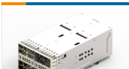
TE Part #2227670-7 zQSFP+ STACKED RECEPTACLE ASSEMBLY 2X2