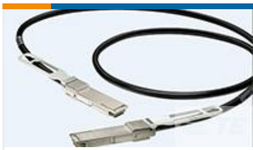
TE Part # 2829040-6 QSFP IB EDR, 30AWG, 2.0M