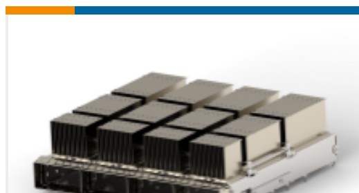
TE Part #2343989-3 RECEPT CAGE ASSY 1X4 QSFP-DD W HS