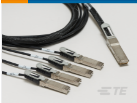
TE Part # 2821033-8 QSFP TO [4]SFP+, 28G, 1M, 33AWG