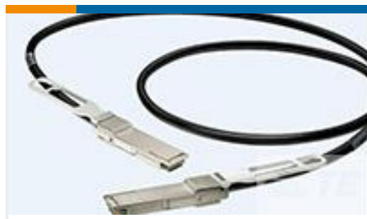
TE Part # 2829040-8 QSFP IB EDR, 26AWG, 3.0M