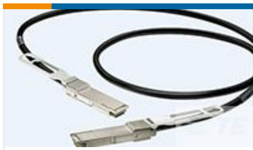
TE Part # 2829040-7 QSFP IB EDR, 26AWG, 2.0M