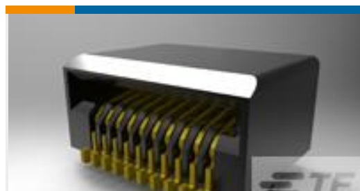
TE Part #2170088-1 ZSFP+ Connector, 30u"