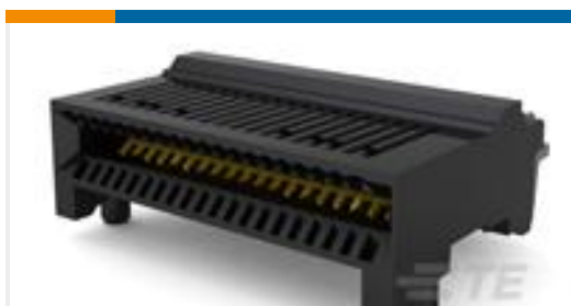
TE Part #1551920-2 zQSFP+ connector assembly