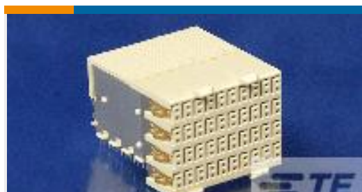
TE Part #2065657-1 zd Plus, 4 pair, receptacle assy