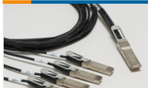
TE Part # 2821033-8 QSFP TO [4]SFP+, 28G, 1M, 33AWG