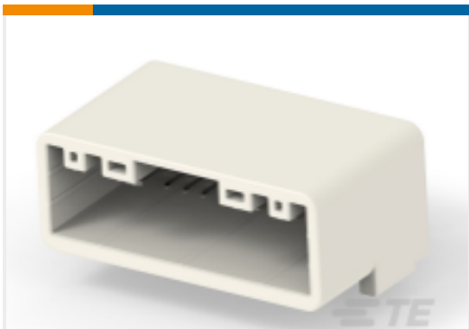
TE Part #2326782-2 20POS,HYBRID,HDR ASSY,90DEG, SLDR