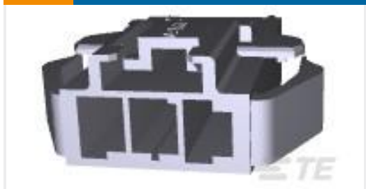
TE Part #2005250-1 PDL 3P CAP 3.96 P/M(GWT) NAT