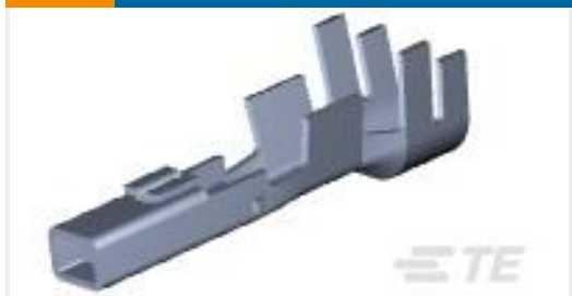
TE Part #177915-1 AMP POWER DBL LOCK REC (L)