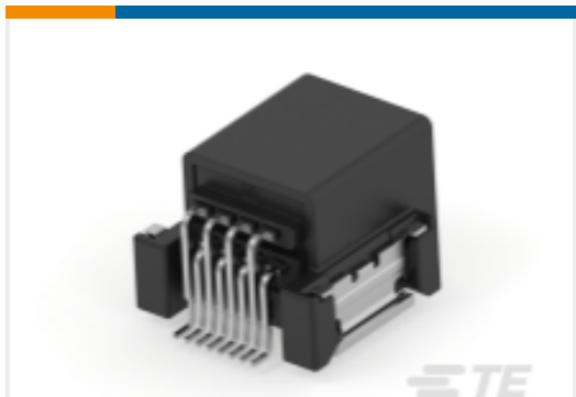
TE Part #2237149-2 8POS,TAB0.64X0.64,HDR ASSY, 90DEG,SMD