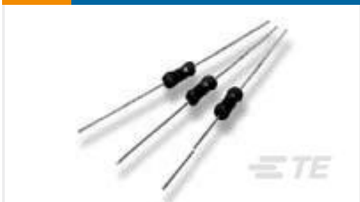
TE Part #1-1625885-4 1W SM M/OX 5% 10R