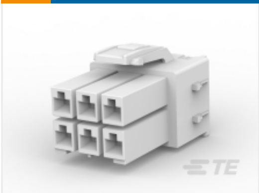
TE Part #2005247-1 Glow Wire Power Double Lock Plug