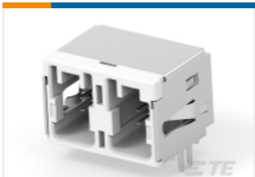
TE Part #2362662-1 8POS,0.50,HDR ASSY,90DEG,KEY-A, KEY-D