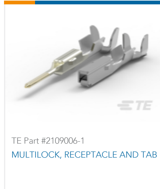
TE Part #2109006-1 MULTILOCK, RECEPTACLE AND TAB