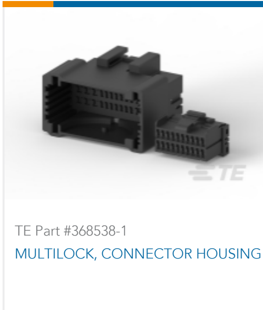
TE Part #368538-1 MULTILOCK, CONNECTOR HOUSING