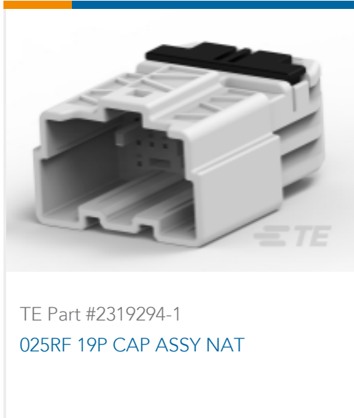
TE Part #2319294-1 025RF 19P CAP ASSY NAT