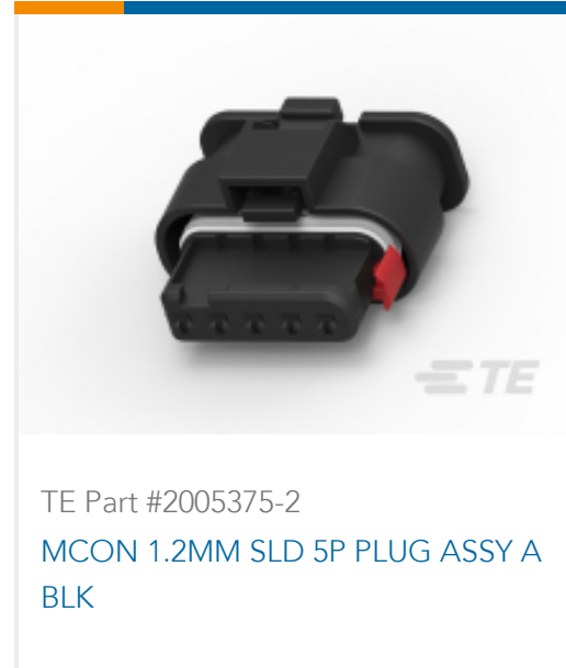
TE Part #2005375-2 MCON 1.2MM SLD 5P PLUG ASSY A BLK