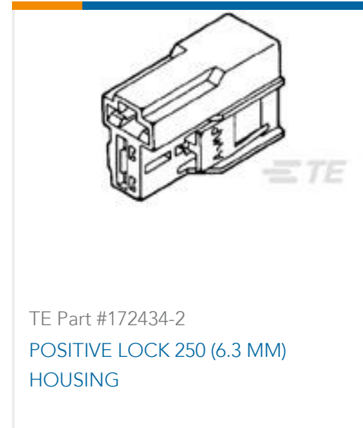
TE Part #172434-2 POSITIVE LOCK 250 (6.3 MM) HOUSING