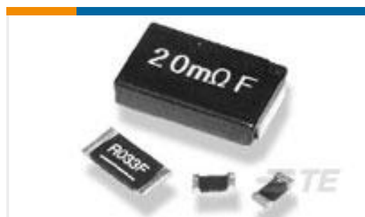
TE Part #2176076-2 TLRS1050 4.0W R001 1% 60PPM 3K RL