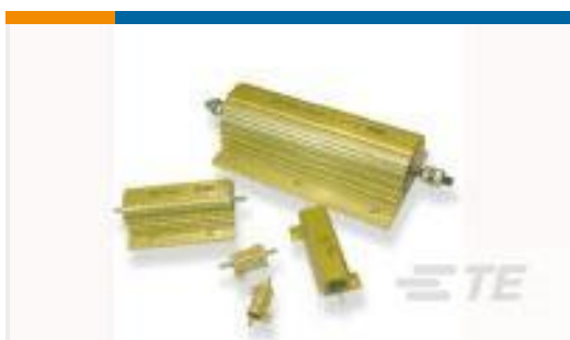
TE Part #2-1625999-0 HSC100 22R 5%