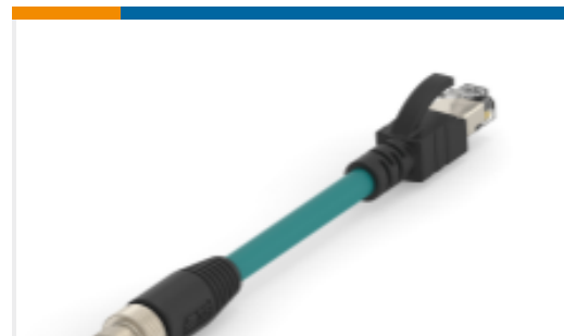
TE Part #TCX3872A202-002 RPC-M12X-8MS-1.0SH-RJ45-8MS-TPE