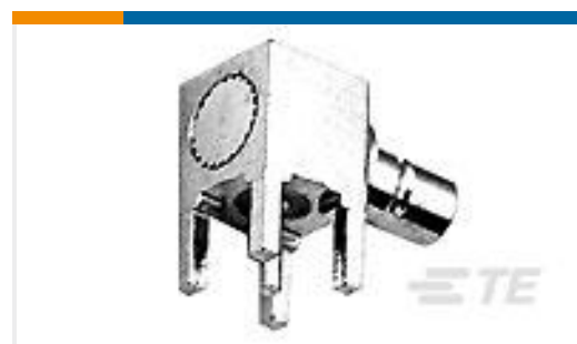
TE Part #1-1337481-0 SMB R/A PCB Skt 50Ohm Gold Plt