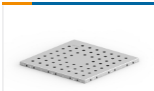
TE Part #2118725-2 STD SHIELD COVER, CRS-44.97X44.97X2.00MM