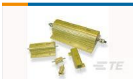
TE Part #1-1630019-3 HSC200 22R 5%