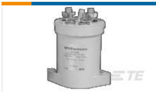
TE Part #5-1618388-8 LEV200A6NAA=RELAY, SPST-NO