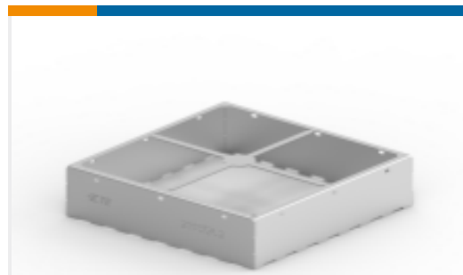
TE Part #2118726-2 STD SHIELD FRAME, CRS-44.37X44.37X9.75MM