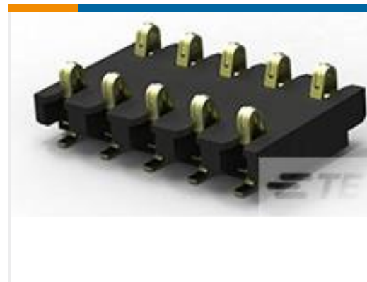
TE Part #2199035-2 10 PINS,1.6PICH,1.65H BTOB CONN. 2 ROW