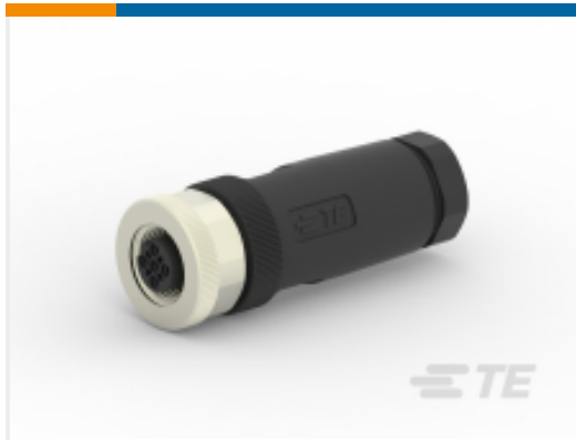
TE Part #T4110402021-000 M12,FEMALE,STRAIGHT,B CODE,2P, PG9,GOLD