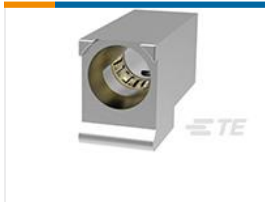
TE Part #2000713-4 RA Keyed Guide Mod, Vita 46, Machined