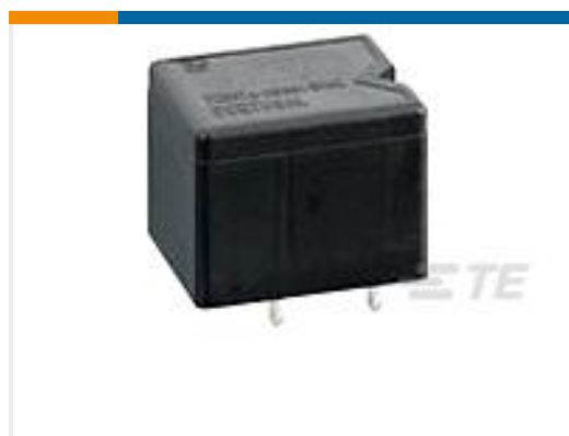
TE Part #1393277-8 V23076A1022C133