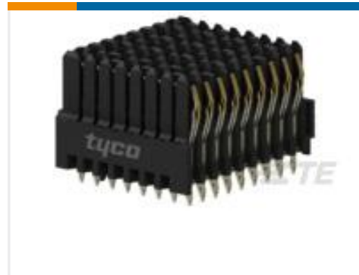
TE Part #2102735-1 BP, Half Left End, MULTIGIG RT 2R