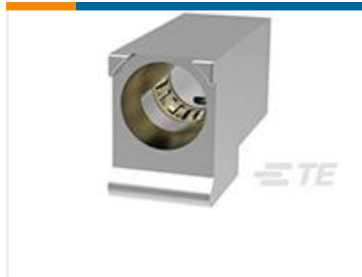
TE Part #2000713-3 RA Keyed Guide Mod, Vita 46, Machined