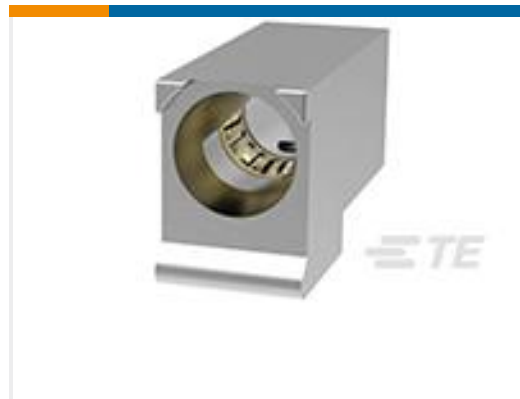
TE Part #2000713-1 RA Keyed Guide Mod, Vita 46, Machined