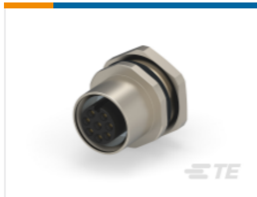
TE Part #T4171320008-001 M12,FRONT MOUNT,FEMALE, A, 8P, 0.2M WIRE