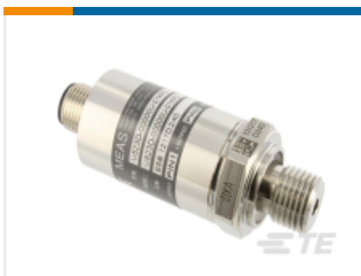
TE Part #11033273-00 PRESS XDCR U5254-000002-.14BG