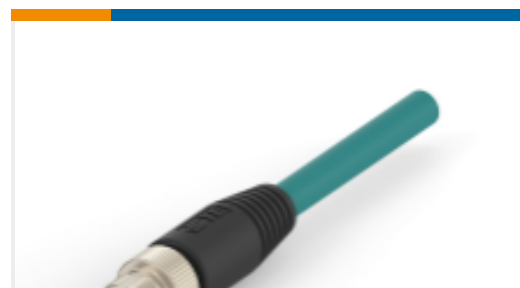
TE Part #TAX3812A202-004 RPC-M12X-MS-8CON-TPE-3.0SH