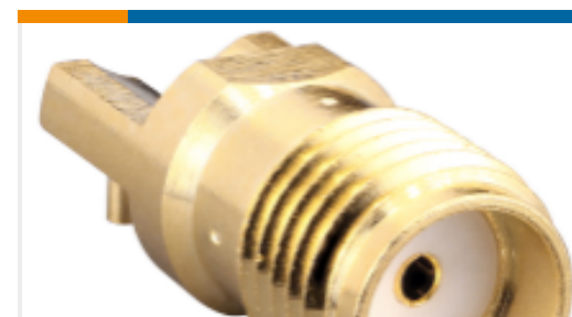
TE Part #CONSMA022-G SMA Jack 50 Ohm PCB Edge Mount