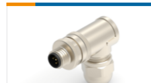
TE Part #T4113411051-000 M12 M, 5P GOLD B_CODE RA SHIELDED PG7