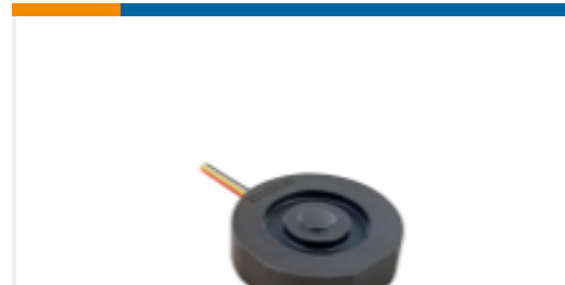
TE Part #20009605-22 Compact Compression Load Cell