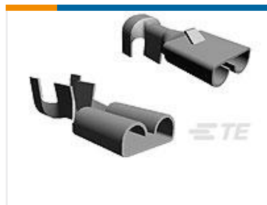
TE Part #180351-3 FF 250 REC 4-6MM2 PB