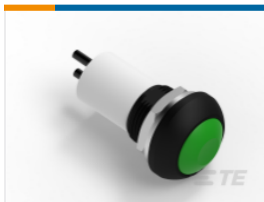
TE Part #2329384-4 PB OFF/ON FC GRE M1 TERM IP68 500MM L