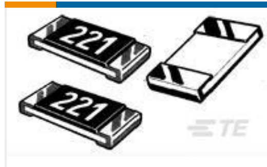
TE Part #2-2176232-2 3522 1M0 1% 3W