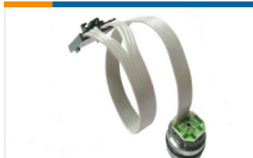
TE Part #86-015G-C 15 PSIG MV PRESSURE SENSOR