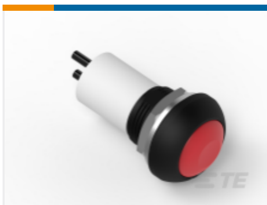
TE Part #2329384-2 PB OFF/ON FC RED M1 TERM IP68 500MM L