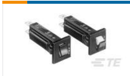
TE Part #2-1393250-2 W28-XQ1A-0.75=W28