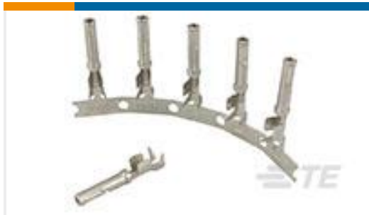
TE Part #1062-16-1422 SOC, SF, SIZE 16, 14-18, SLVLES, NI/NI