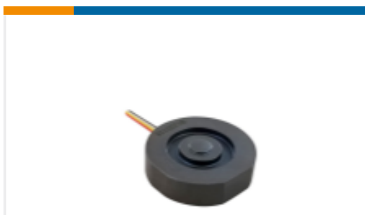
TE Part #20009605-12 Compact Compression Load Cell