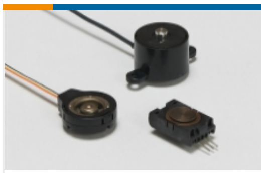
Force Sensor Elements(47)