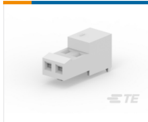
TE Part #3-640441-5 MTA Receptacle: Nylon, Tin Plated, 2.54 mm