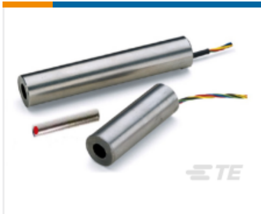
TE Part #02560395-000 LVDT HR 1000 ASSY