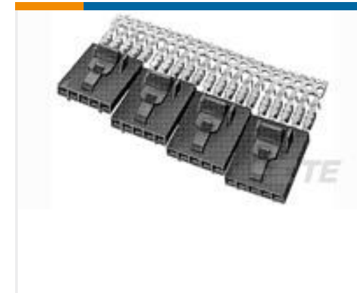
TE Part #5-103957-1 10X2 MTE RCPT SR LATCH .100CL