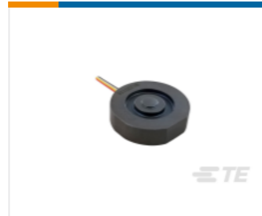
TE Part #20009605-21 Compact Compression Load Cell