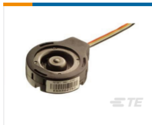
TE Part #FX1900-0000-0025-L 25 LBF COMPRESSION LOAD CELL 100MV