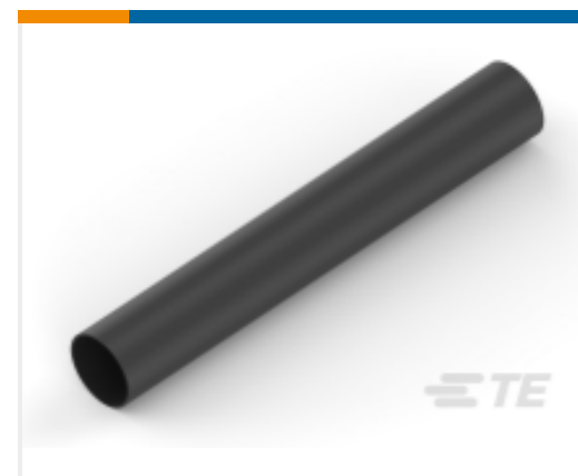
TE Part #NB14902001 DWP-125-3/16-0-STK