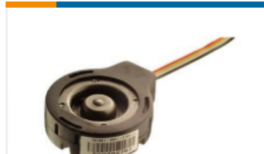
TE Part #FX1901-0001-0100-L FX1901-0001-0100-L