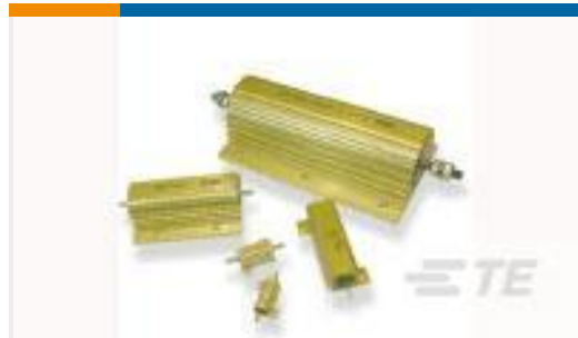
TE Part #1-1625999-4 HSC100 1R0 5%