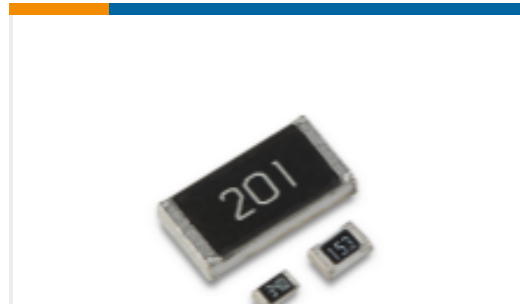
TE Part #5-2176328-3 CRGP 1206 220K 1%