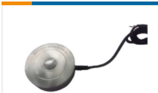
TE Part #FC2311-0000-0500-L FC23 MV 2FT CABLE 500L