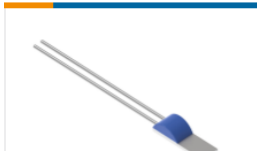
TE Part #NB-PTCO-012 Pt1000, 1.2x4.0, Class B, PTFM102B1G0