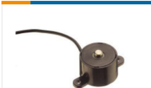
TE Part #FC2231-0000-0050-L MID RANGE COMPRESSION SENSOR