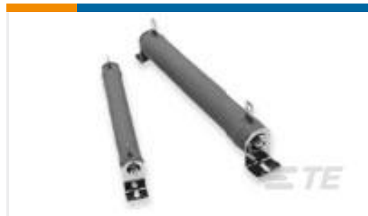
TE Part #1879457-1 TE 2500W 1R0 5% Bracket