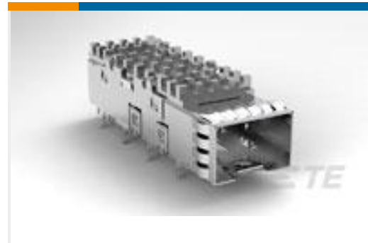
TE Part #2007464-1 SFP+ 1x1 Cage Assy, PF,with Heatsink AU