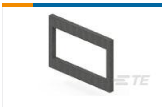
TE Part #2132186-2 EMI Gasket, QSFP/XFP 1x1