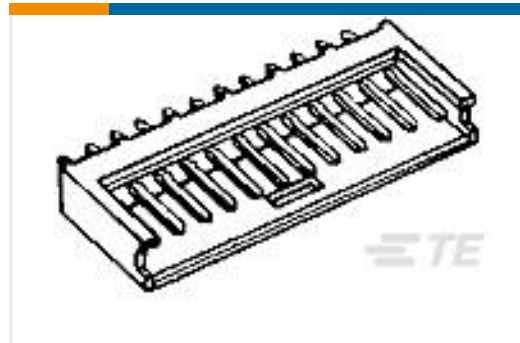
TE Part #280374-2 10P AMPMODU II SHRD HDR, ST, 0.38 AU