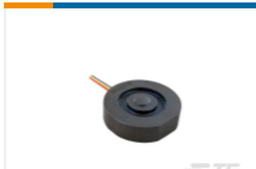
TE Part #20009605-04 FX292X-100A-0010-L