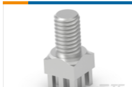
TE Part #225777-E POWELM STIFT VOLL M5 8 2,54 * EP 4,0 *