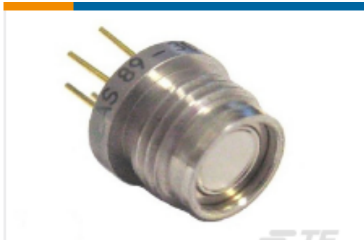
TE Part #89-03KA-0U 3K PSIA 316L MV PRESSURE SENSOR