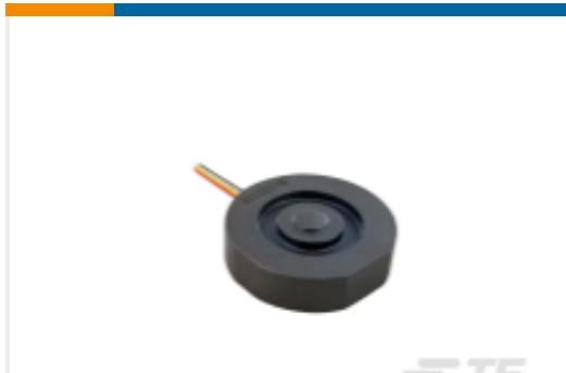
TE Part #20009605-02 FX292X-040B-0050-L