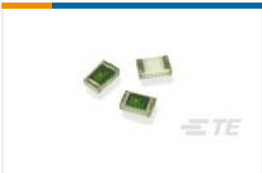
TE Part #6-2176087-5 RP 1J 0.166W 324R 0.1% 25PPM 1K RL