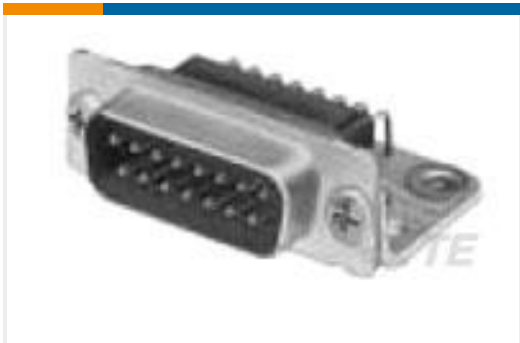
TE Part #5745354-4 37 PLUG RA/MS STD