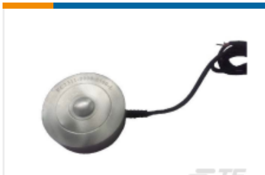
TE Part #FC2311-0000-0050-L COMPRESSION LOAD CELL - 100MV / 0.5-4.5V