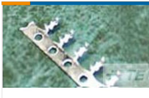
TE Part #1734193-1 WTB Socket,Terminal 80u" Tin