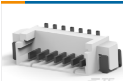
TE Part #1734598-4 AMP HPI 1.25 mm Headers