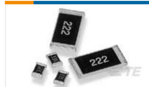
TE Part #1623140-1 CRG0805 1% 1K8