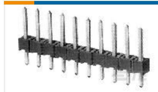
TE Part #826630-2 2P AMPMODU II STIFT LEI