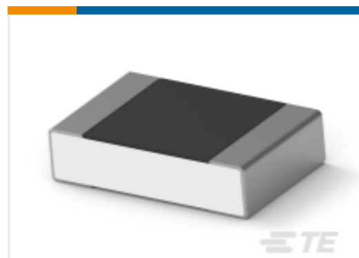
TE Part #5-2176381-5 RQ 0805 45K3 0.1% 10PPM 5K RL