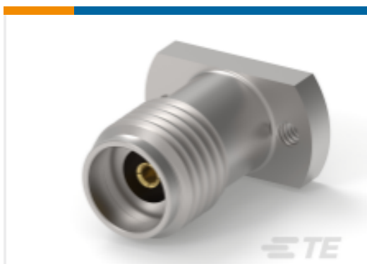
TE Part #2081570-2 2.92MM JACK 2 HOLE FLANGE RECEPTACLE