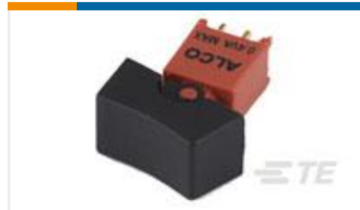
TE Part #2267087-5 RMS1R102M7QES