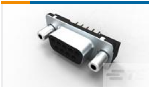
TE Part #1-5747150-3 09 RCPT SP/FMS SCRLK