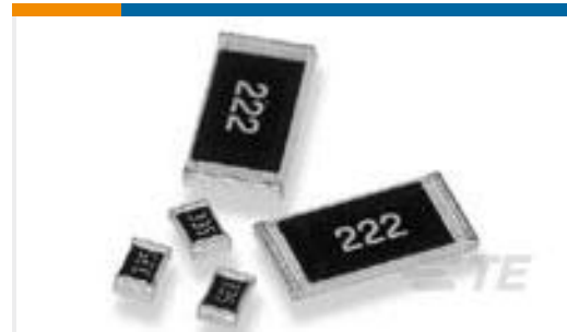
TE Part #1623475-1 CRG1206 1% 2K2