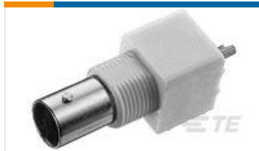
TE Part #5227222-3 VERT JK W/MTG PINS, BNC PCB