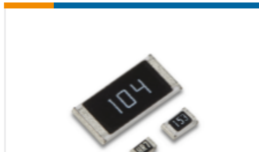
TE Part #2176337-9 CRGCO 0402 47R 1%