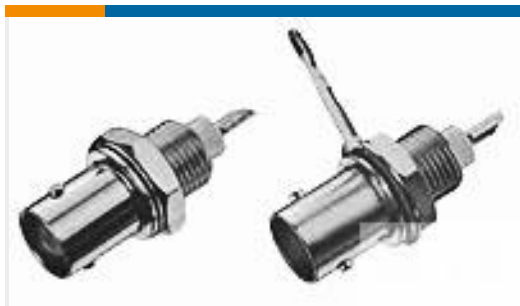
TE Part #5227169-8 BNC - SOLDER RECEPT