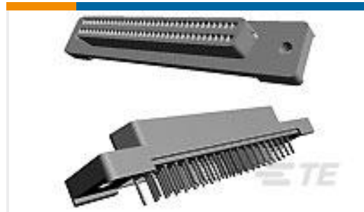
TE Part #5749070-7 68 50SR VERT RCPT ASSY