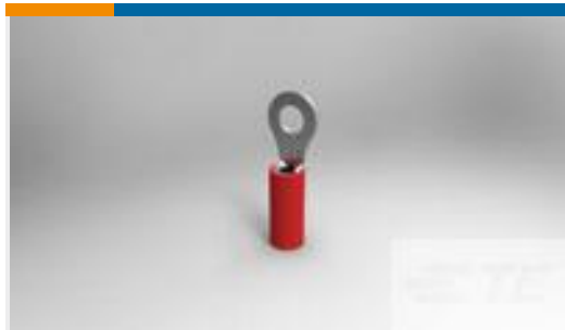
TE Part #36152 PIDG R 22-16 COMM 22-18 MIL 6