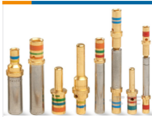
TE Part #38943-22L CONT SOC ASSY