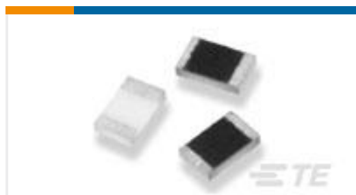
TE Part #4-1624108-7 3640 0402 2.5nH +/-0.2nH 1K RL