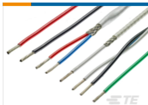
TE Part #F594413001 44A0121-20-0/9CK0049/1