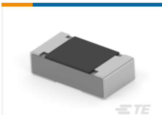
TE Part #9-2176480-4 RA73F 1J 5K11 0.1% 5K RL