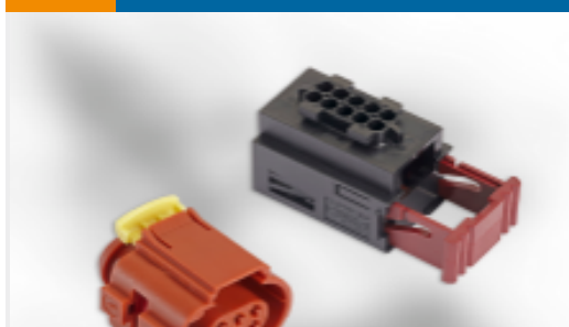
TE Part #1-967629-5 Timer Connector Housing