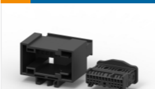
TE Part #2-968326-1 MQS, CONNECTOR HOUSING