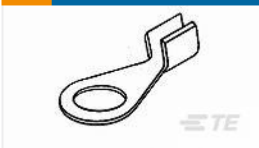
TE Part #61546-1 RING TONGUE 10-6 AWG TPCUBR