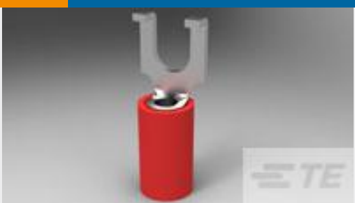
TE Part #2-32562-2 PIDG SPDFLG 22-16COM22-18MIL 8