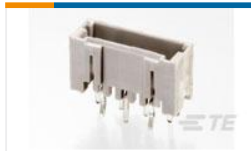
TE Part #292207-3 MINI CT SGL DIP V 3P NAT