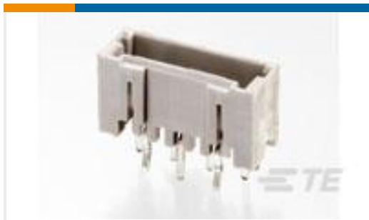
TE Part #292207-7 MINI CT SGL DIP V 7P NAT