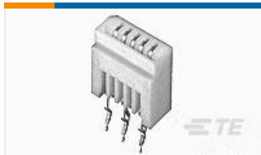
TE Part #1-84984-2 1mm FFC DIP V ASSY 12P TUBE