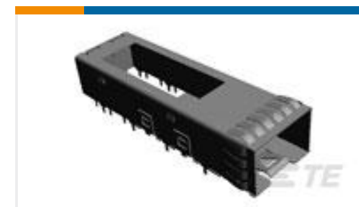
TE Part #2110304-1 SFP+ 1x1 Cage Assembly, Solder Tail