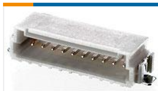
TE Part #292227-6 1.5 MINI CT SGL H SMT W BOSS 6