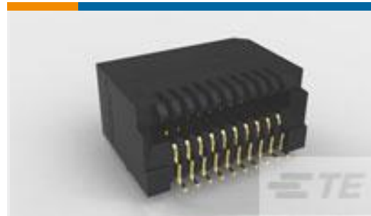
TE Part #1888247-1 20 POS SMT CONN, SFP/SFP+, 30A