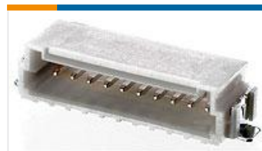
TE Part #1-292227-2 1.5 MINI CT SGL H SMT W BOSS 1