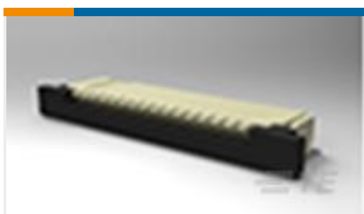
TE Part # 2-84953-1 1MM FPC HORZ.TOP CONT.ASSY 21P