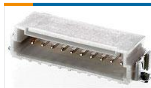
TE Part #292227-9 1.5 MINI CT SGL H SMT W BOSS 9