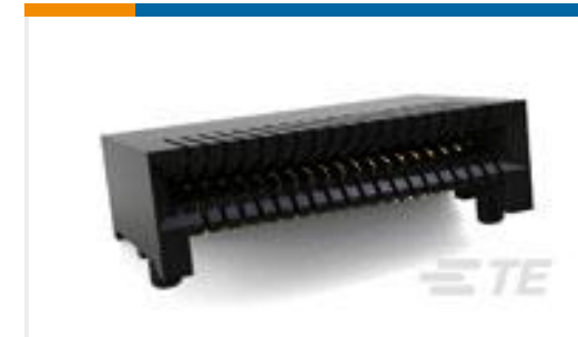
TE Part #1761987-9 ReceptacleConnAssm38PosTape/Re