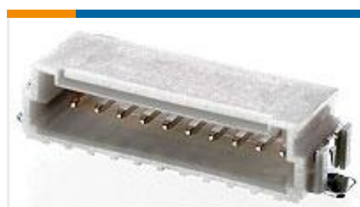
TE Part #292227-3 1.5 MINI CT SGL H SMT W BOSS 3