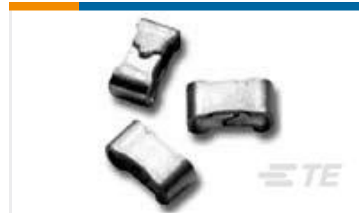
TE Part #1625854-2 0805 PROBE PAD