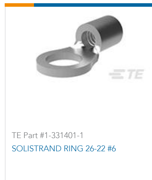
TE Part #1-331401-1 SOLISTRAND RING 26-22 #6