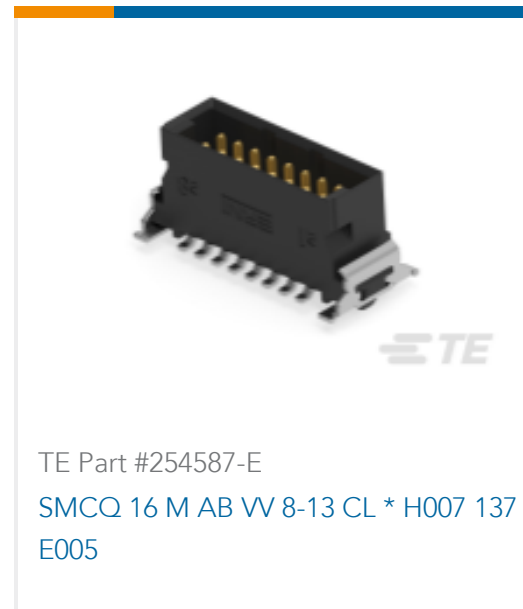
TE Part #254587-E SMCQ 16 M AB VV 8-13 CL * H007 137 E005