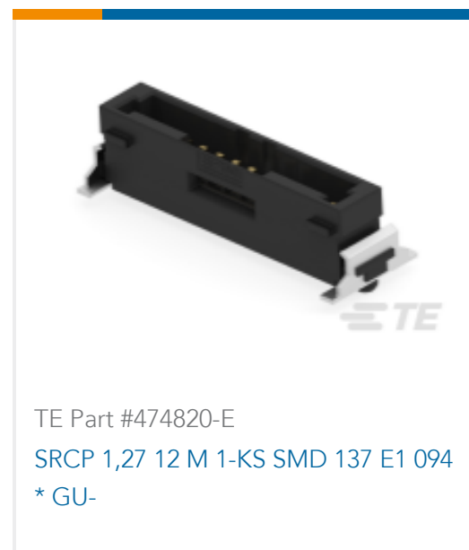
TE Part #474820-E SRCP 1,27 12 M 1-KS SMD 137 E1 094 * GU-