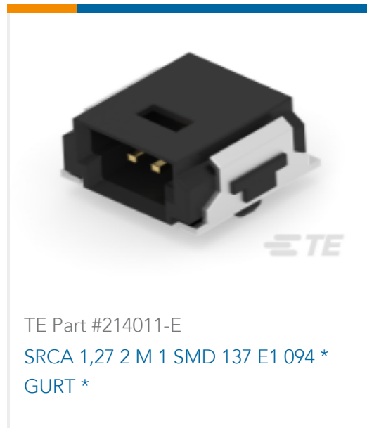
TE Part #214011-E SRC A 1,27 2 M 1 SMD 137 E1 094 * GURT *