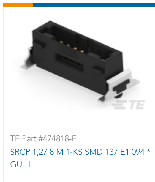
TE Part #474818-E SRCP 1,27 8 M 1-KS SMD 137 E1 094 * GU-H