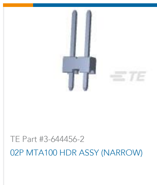
TE Part #3-644456-2 02P MTA100 HDR ASSY (NARROW)