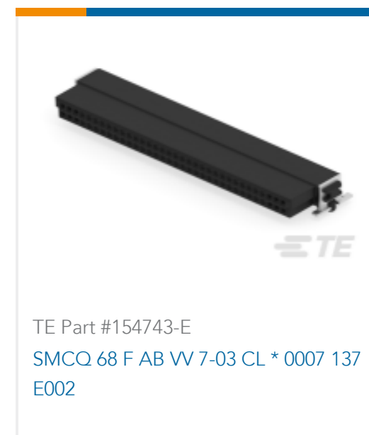
TE Part #154743-E SMCQ 68 F AB VV 7-03 CL * 0007 137 E002