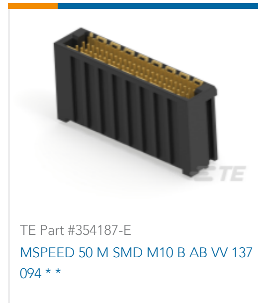
TE Part #354187-E MSPEED 50 M SMD M10 B AB VV 137 094 * *