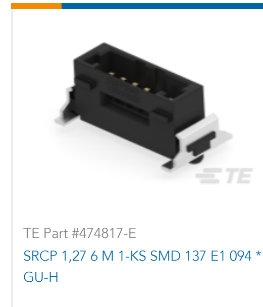
TE Part #474817-E SRCP 1,27 6 M 1-KS SMD 137 E1 094 * GU-H