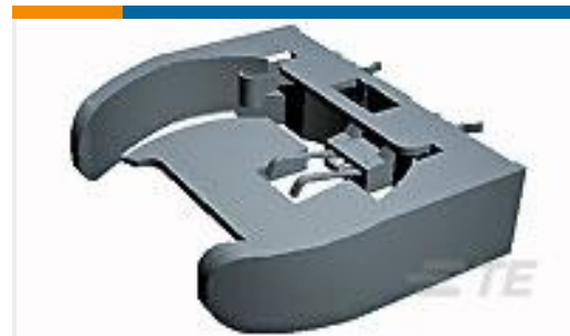
TE Part #1775485-1 Battery Holder, 3.6mm, BLK,low profile