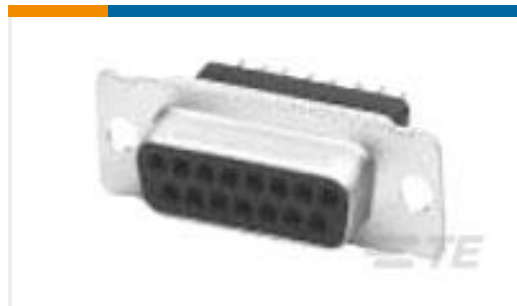
TE Part #5747190-1 09 RCPT SP/MS CNUT