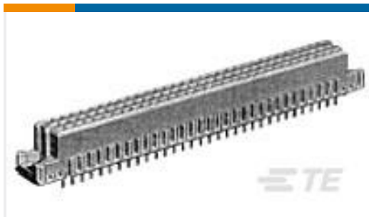
TE Part #5535090-4 ASSEMBLY,RECEPTACLE,EUROCARD, T