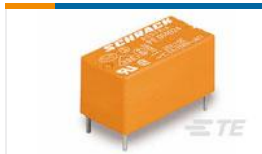
TE Part #1393219-3 PE014005