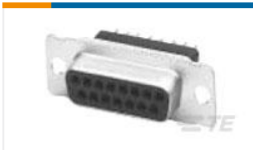
TE Part #5745886-1 25 RCPT SP/MS CNUT