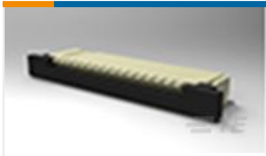
TE Part # 2-84953-5 1MM FPC HORZ.TOP CONT.ASSY 25P