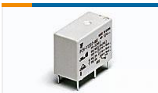
TE Part #9-1440003-0 PCH-105D2H,000