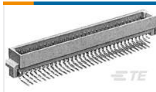
TE Part #5650473-5 ASSY,PIN,EUROCARD,TYPE C,LEAD-