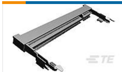
TE Part #1473005-1 SEMI HARD TRAY DDR SOCKET 200P