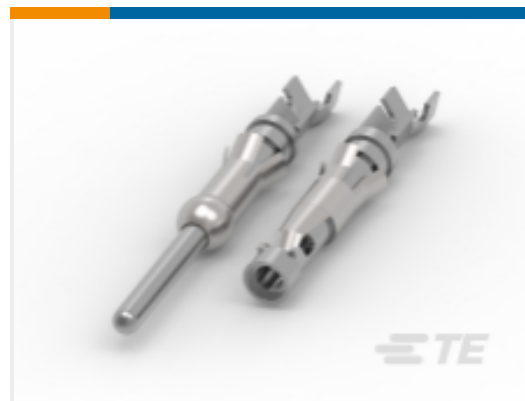
TE Part #1-66360-2 Pin and Socket Contacts, Type III, LP