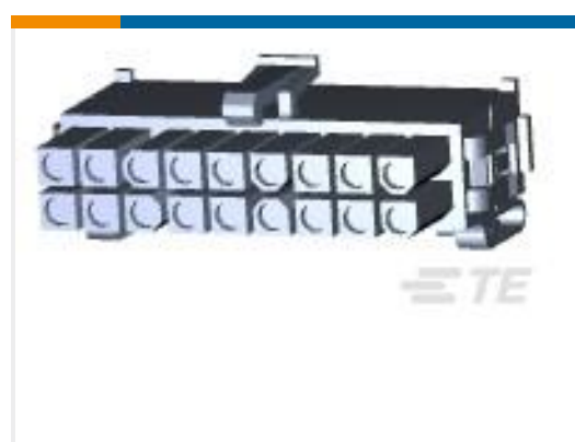
TE Part #794208-1 18P MINI UMNL2 PLUG HSG UL94V0