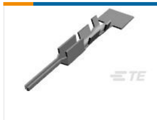
TE Part #1-794608-1 PIN CONT 20-24 15 GOLD STRIP