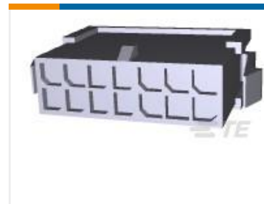
TE Part #1-794615-4 PANEL MT DBL ROW HSG 14 POS