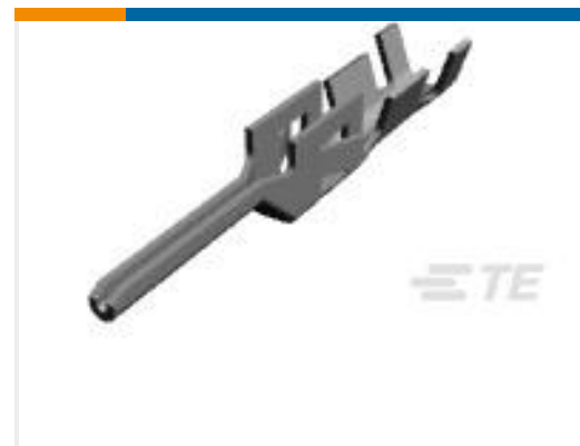
TE Part #1-794612-1 PIN CONT 20-24 15 GOLD L/P