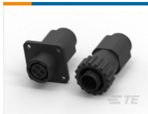
TE Part # CAT-AM71-C83998Y One-Piece Connector, Sealed, CPC Series 1