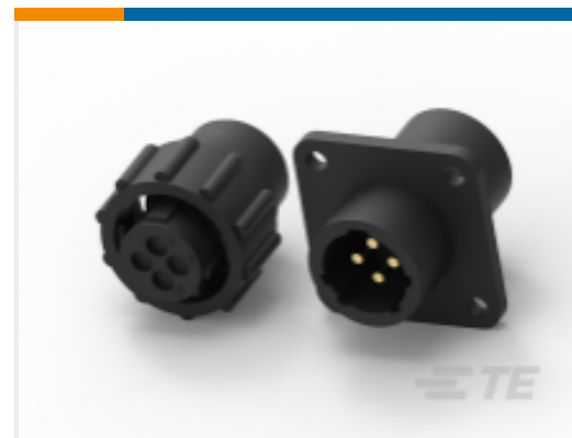
TE Part # CAT-AM71-C83998J Cable/Panel Mount Connector, CPC Series 1