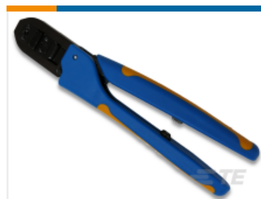
TE Part # 91519-1 CCII TYPE III+ PIN SKT 18-14 ASSY