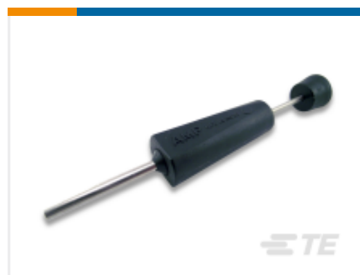
TE Part # 305183 EXTRACT TOOL TYPE 2 20-16