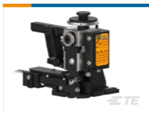
TE Part # 2151101-1 OCEAN_2.0_APPLICATOR-S-090F120O