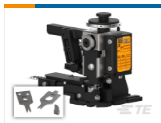
TE Part # 7-2151101-1 OCEAN_2.0_APPLICATOR-S-090F120O