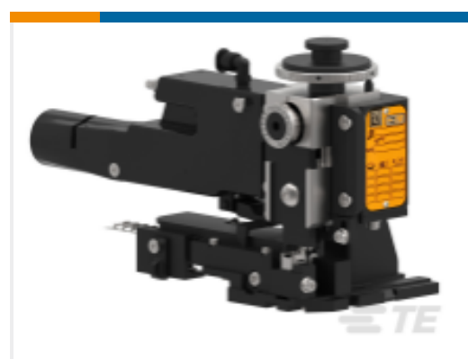
TE Part # 2151101-2 OCEAN_2.0_APPLICATOR-S-090F120O