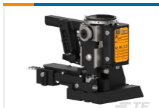
TE Part # 2-2151101-1 OCEAN_2.0_APPLICATOR-S-090F120O