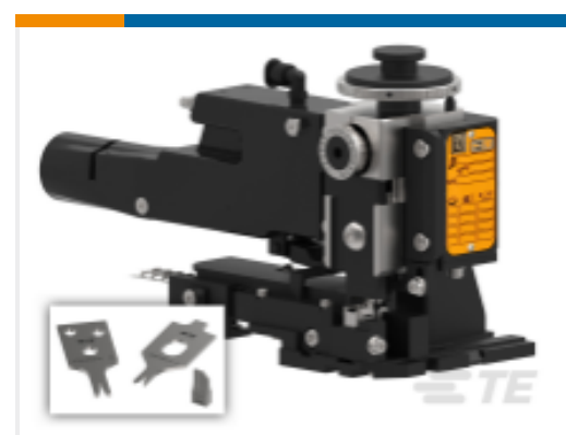
TE Part # 7-2151101-2 OCEAN_2.0_APPLICATOR-S-090F120O