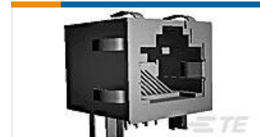
TE Part #1-406541-1 MJ, INV, 1X1, 6PNL G., 100"ST, SN