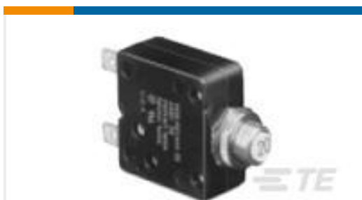
TE Part #4-1393249-2 W58-XC4C12A-2=W58