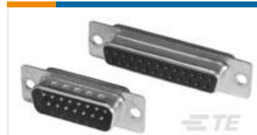
TE Part #5-747908-2 15 Plug Solder Cup, Gold Flash