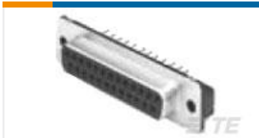
TE Part #5745967-4 25 RCPT SP/FMS STD