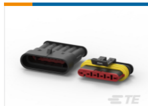
TE Part #282080-1 AMP SUPERSEAL 1.5MM, CONNECTOR HOUSING