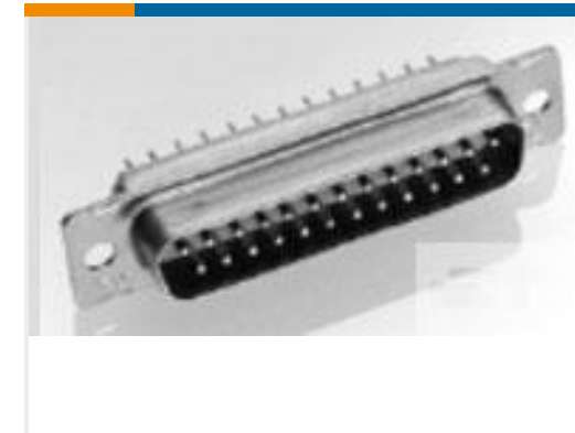
TE Part #205559-2 RECEPT ASSY,25 POSN,AMPLIMITE