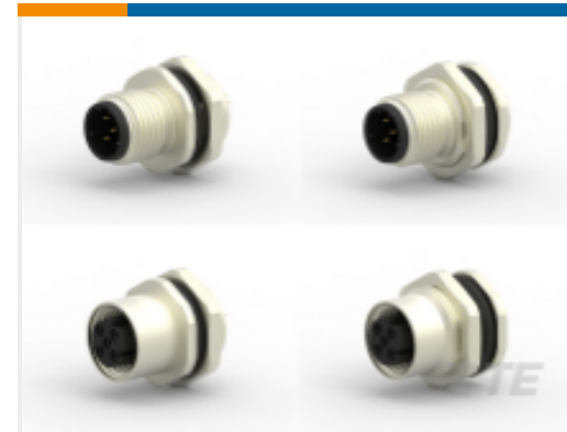
TE Part #T4132012041-000 M12 Panel Mount Solder Cups