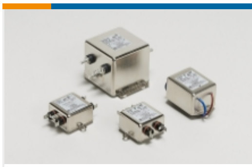
Single Phase Filters(13)