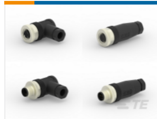
TE Part #T4113002041-000 M12 Field Installable Unshielded