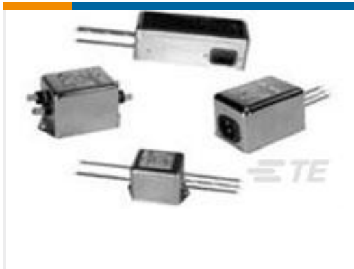
TE Part #6609048-5 6EQ1=F7262 S0