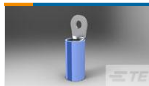
TE Part #52274 TERMINAL,PIDG R IR 16 4