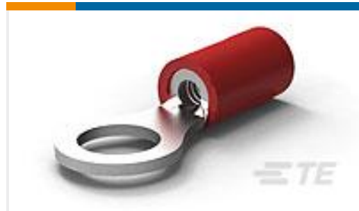
TE Part #130014 TERM, R, PG, 22-16, M5