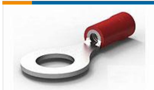
TE Part #34150 PG R 22-16 COMM 22-18 MIL 1/4