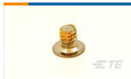
TE Part #1410946-1 MULTI-GIG SOC. CAP SCREW, CUSTOMIZED HDW